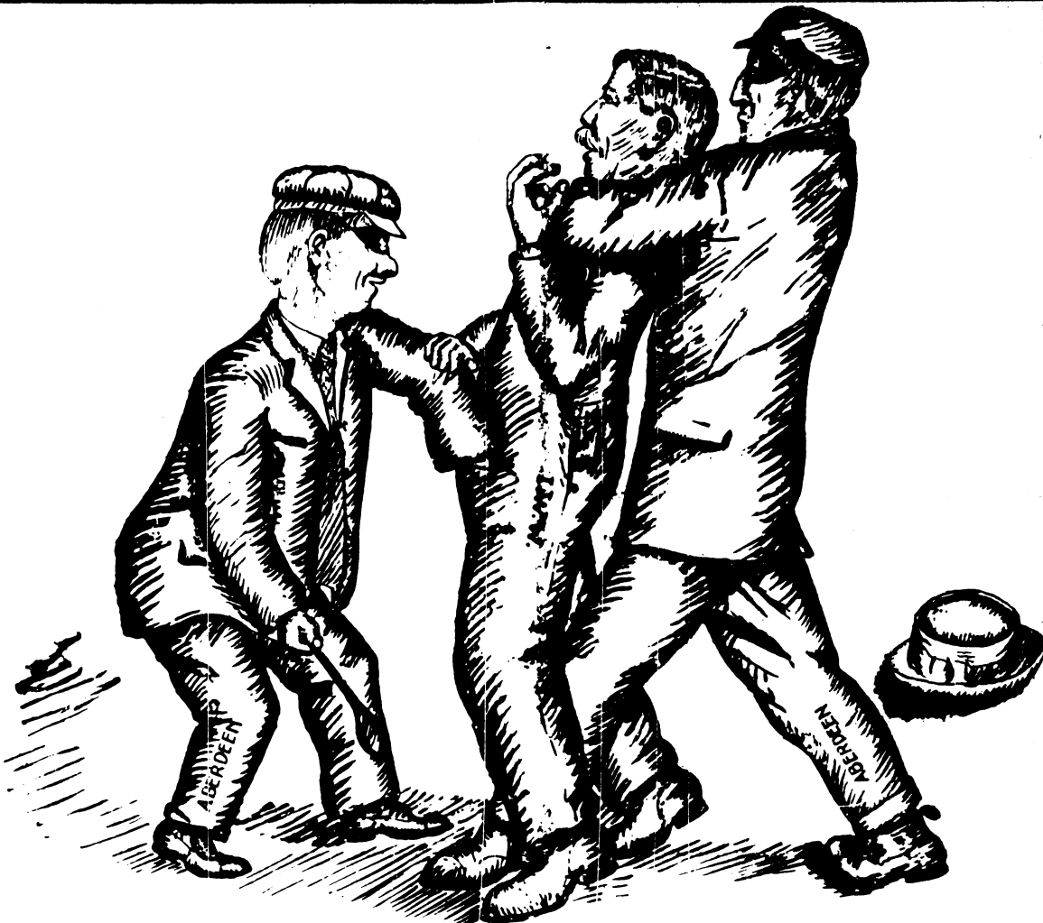
HOW THE SACRED CONSTITUTION IS UPHELD IN ABERDEEN

Every great moral teacher in history has been a heretic.