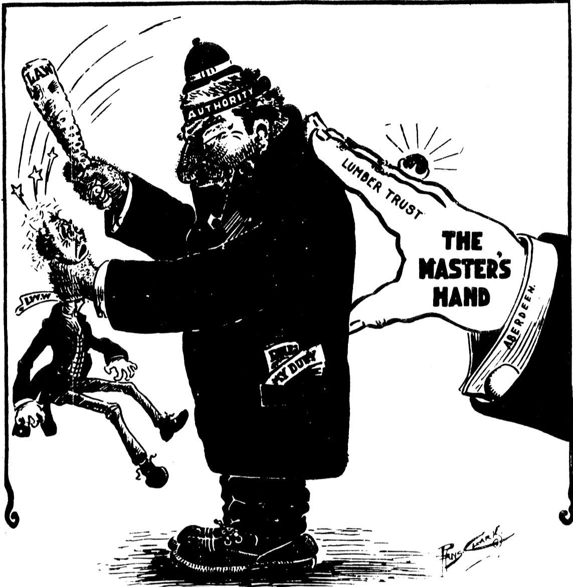
THE MASTER'S DREAM

How many subs did you get this week for the "Worker?" There is work for every member to do and it is good work if you only get a 25c sub a week. If every member of the I. W. W. would do that much the "Worker" would be the largest paper in America and have the greatest circulation in one year.