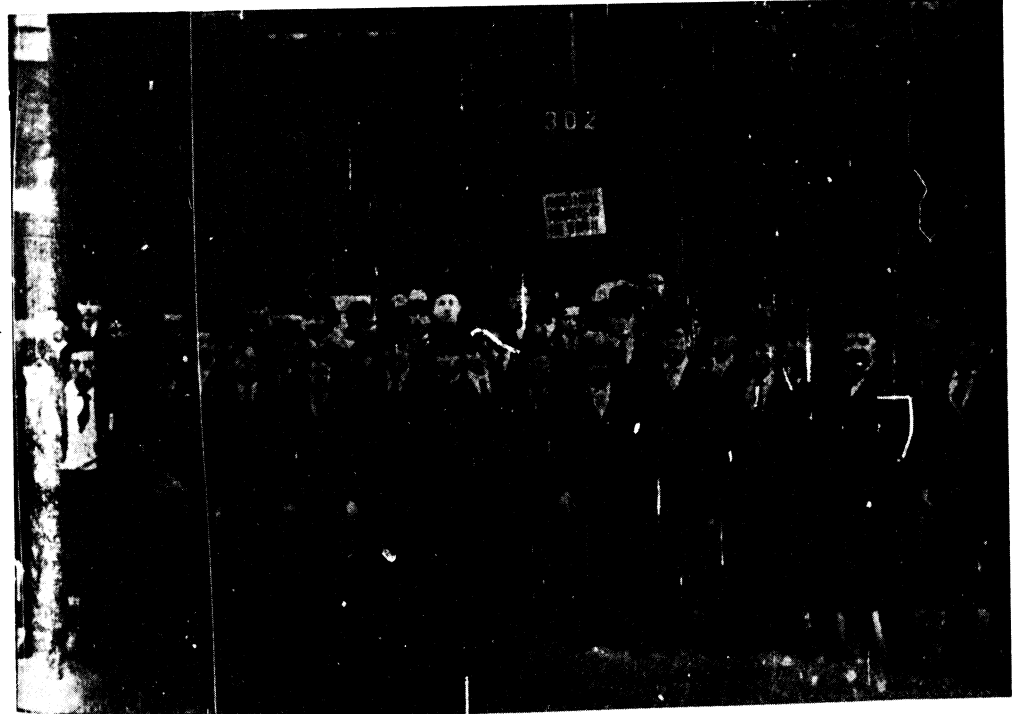
"SPOKANE OR BUST, TO BUST SPOKANE."