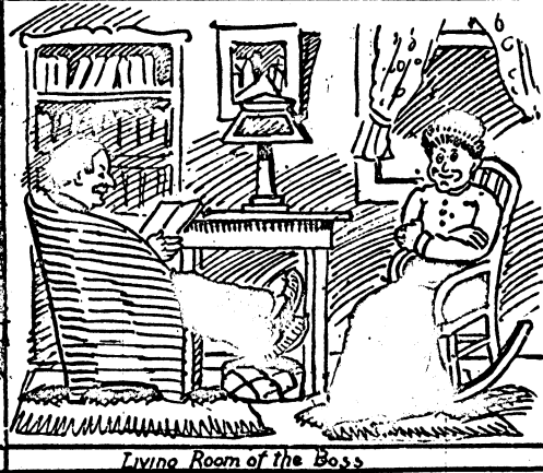
Living Room of the Boss

THE LUMBER JACK WORKS AND HAS NOTHING—THE BOSS LOAFS AND HAS EVERYTHING!