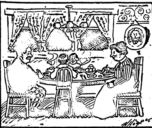
Dining Room of the Boss