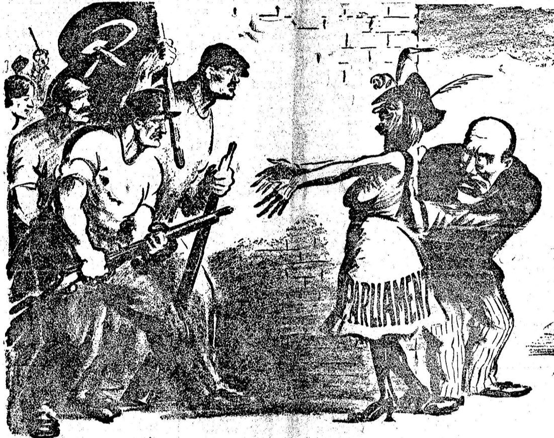
MUSSOLINI: "Here boys, be good now! I'm restoring your long lost sweetie."