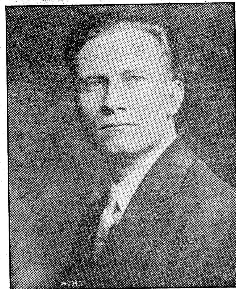
JAMES P. CANNON

Communist Candidate for Governor of New York.