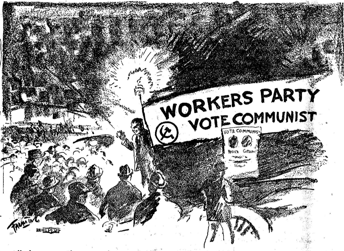
A preliminary meeting on a lesser corner to announce the bigger Red Night Meeting more centrally located.