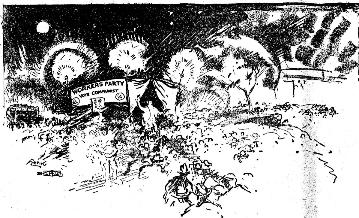
Corner of 110th St. and Fifth Ave., Night of Oct 10.