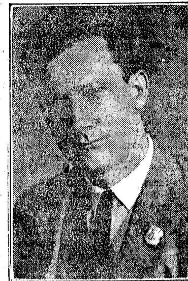
JAMES P. CANNON Communist Candidate for Governor of New York