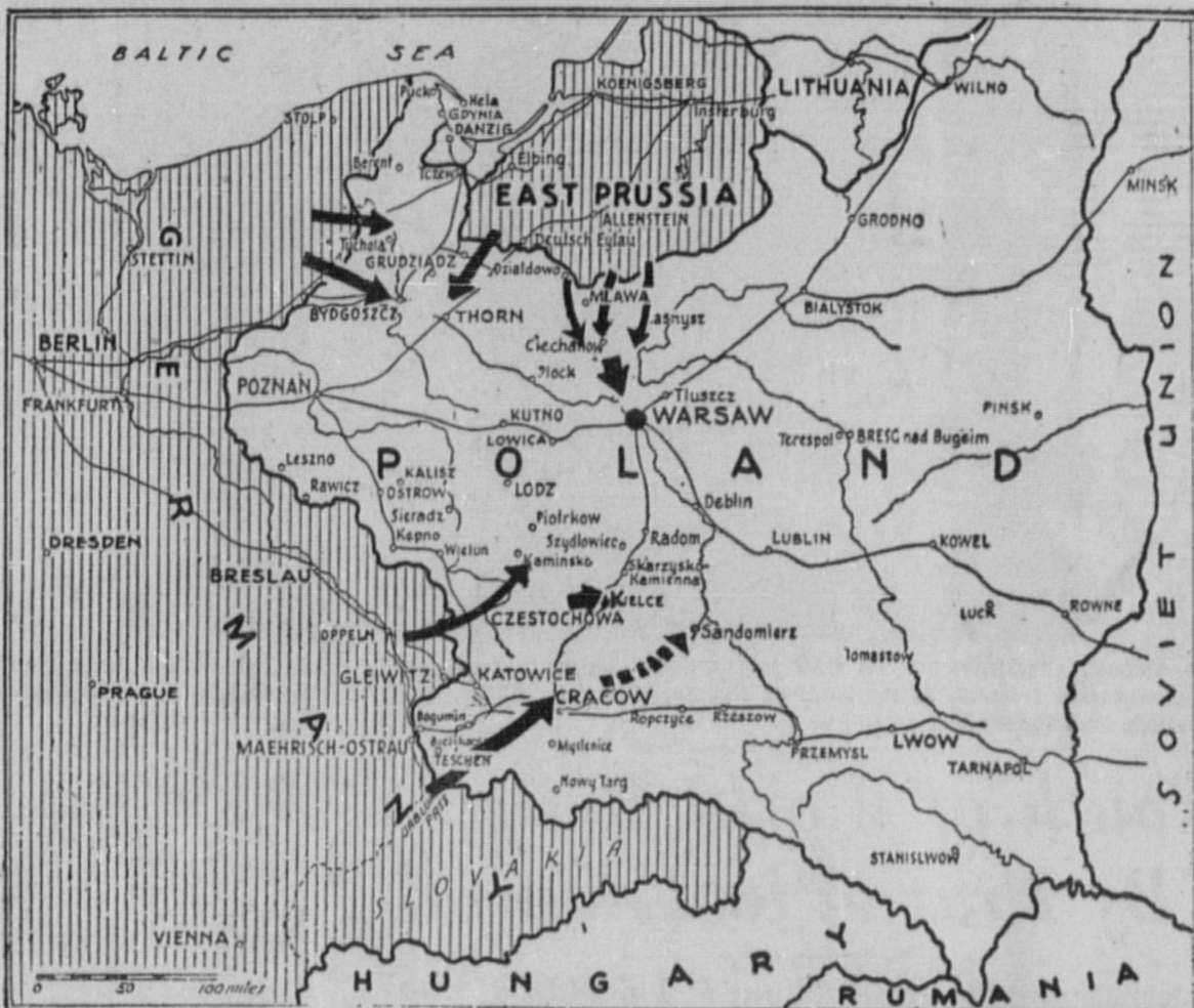
NAZI ARMIES drove to within striking distance of Warsaw, the Polish capital, yesterday while another Hitler force attacking from the Slovak frontier captured Cracow and advanced on the road to Warsaw.

Moreover, while on Sept. 5, Trotzky tried to shout away the true significance of the German-Soviet non-aggression pact by calling it "capitulation" to Hitler, his own sheet in the U. S. was forced to admit growing Soviet strength. The same admission comes even more fully