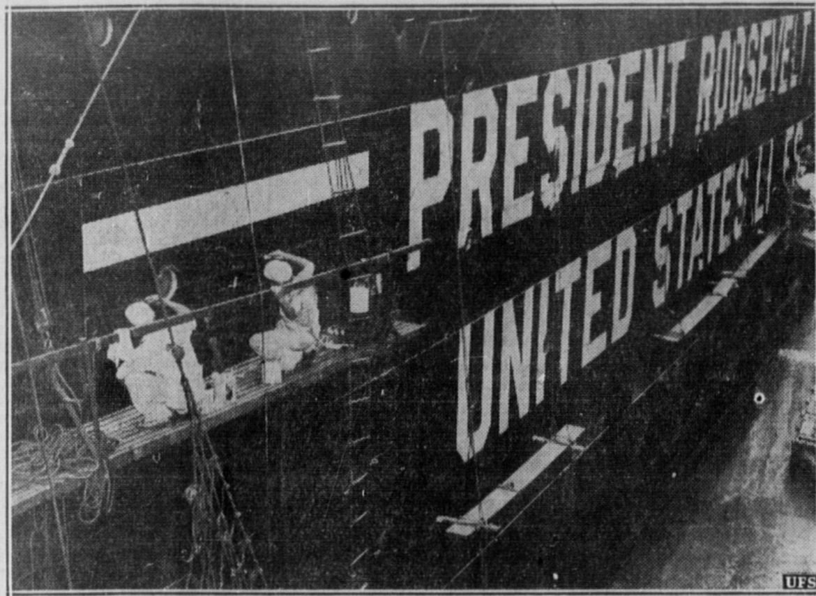
THE NAME OF THE SHIP, operators, and national colors are painted on the sides of the President Roosevelt, before the steamer sailed from New York for Europe, to identify her against attack by ships of war.