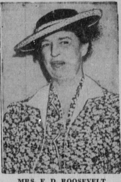
MRS. F. D. ROOSEVELT

Mayor Fiorello H. LaGuardia, guest speaker at the Committee's luncheon yesterday, voiced his fervent hope that this country might stay out of war, and repeated President Roosevelt's words that "neutrality is not at all inconsistent with our conscience and that we would rebel against indignities and wholesale organized cruelty."