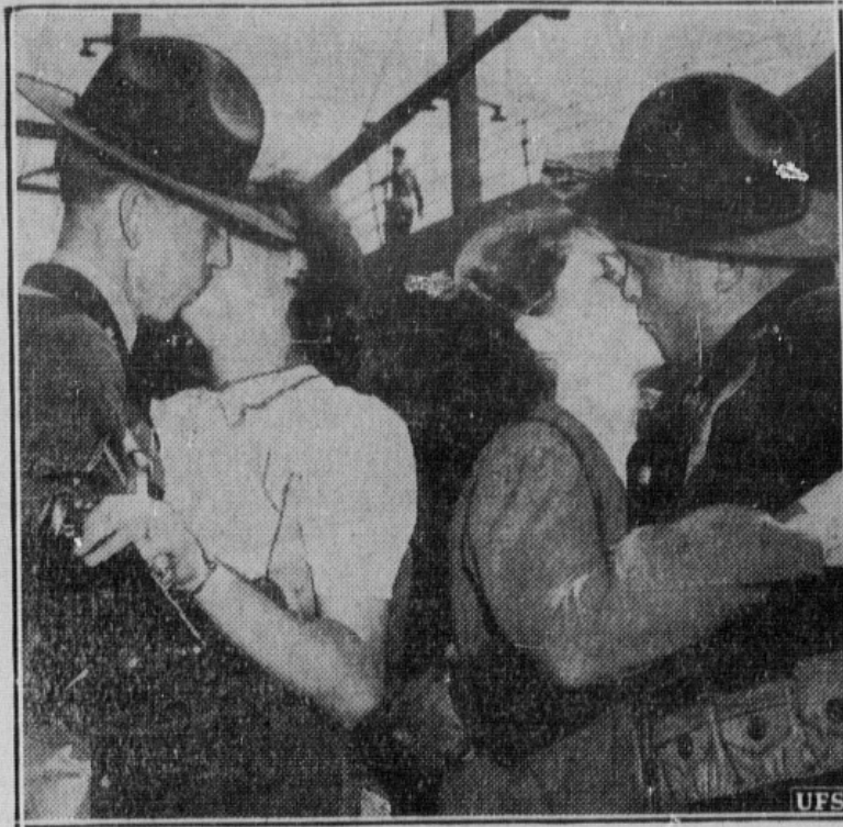
SCENES LIKE THIS were frequent on Los Angeles harbor front as 63rd Coast Artillery left for Panama Canal Zone to strengthen forces in that area.