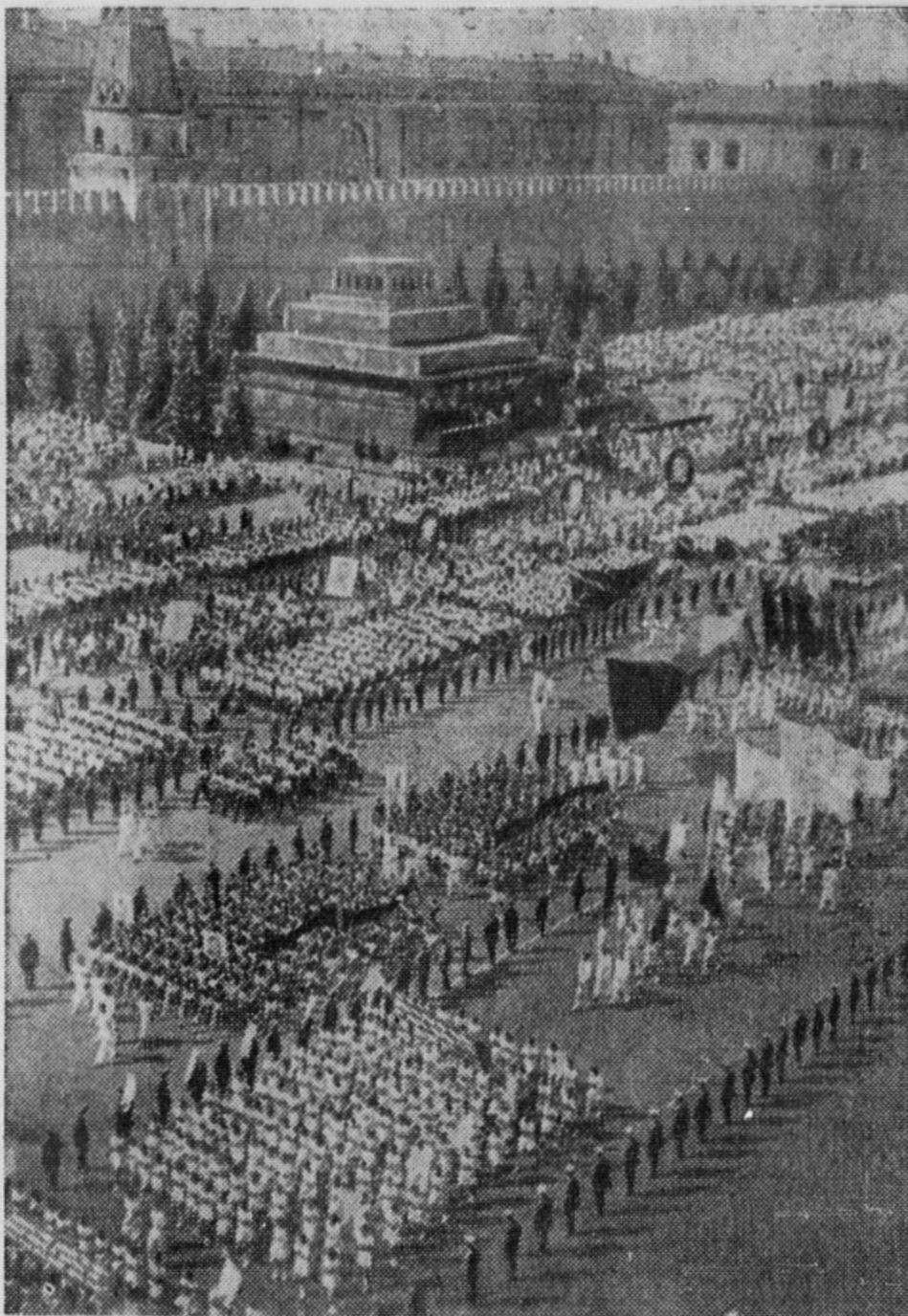
INTERNATIONAL YOUTH DAY in the Soviet Union is traditionally celebrated with a huge youth demonstration from all of the lands of the Soviet Union. Above, part of the demonstrators marching through Red Square last year.