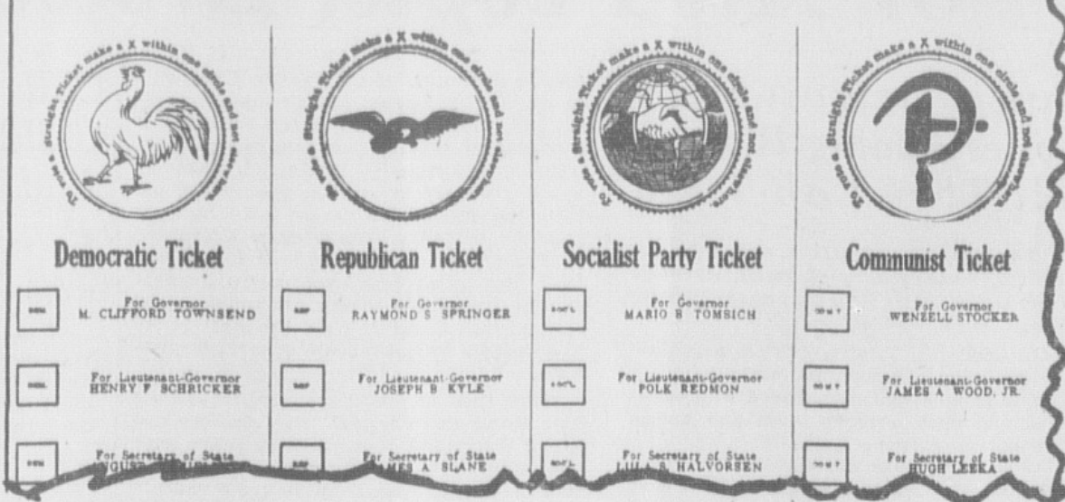
This is how the Indiana state ballot will look next Tuesday. Look carefully and you will see (in the upper right-hand corner) the Communist Party emblem. The ballot, like the Constitution, is just a scrap of paper to Terre Haute officials.