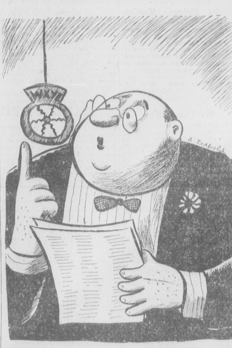
"How much longer are we going to go on starving like this?"