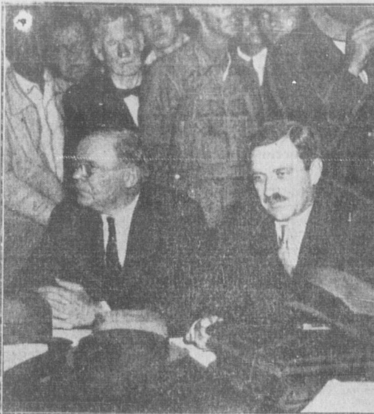
Workers in Terre Haute crowded the court room to hear Earl Browder in his plea for an injunction to bar the police from interfering with his meeting there.