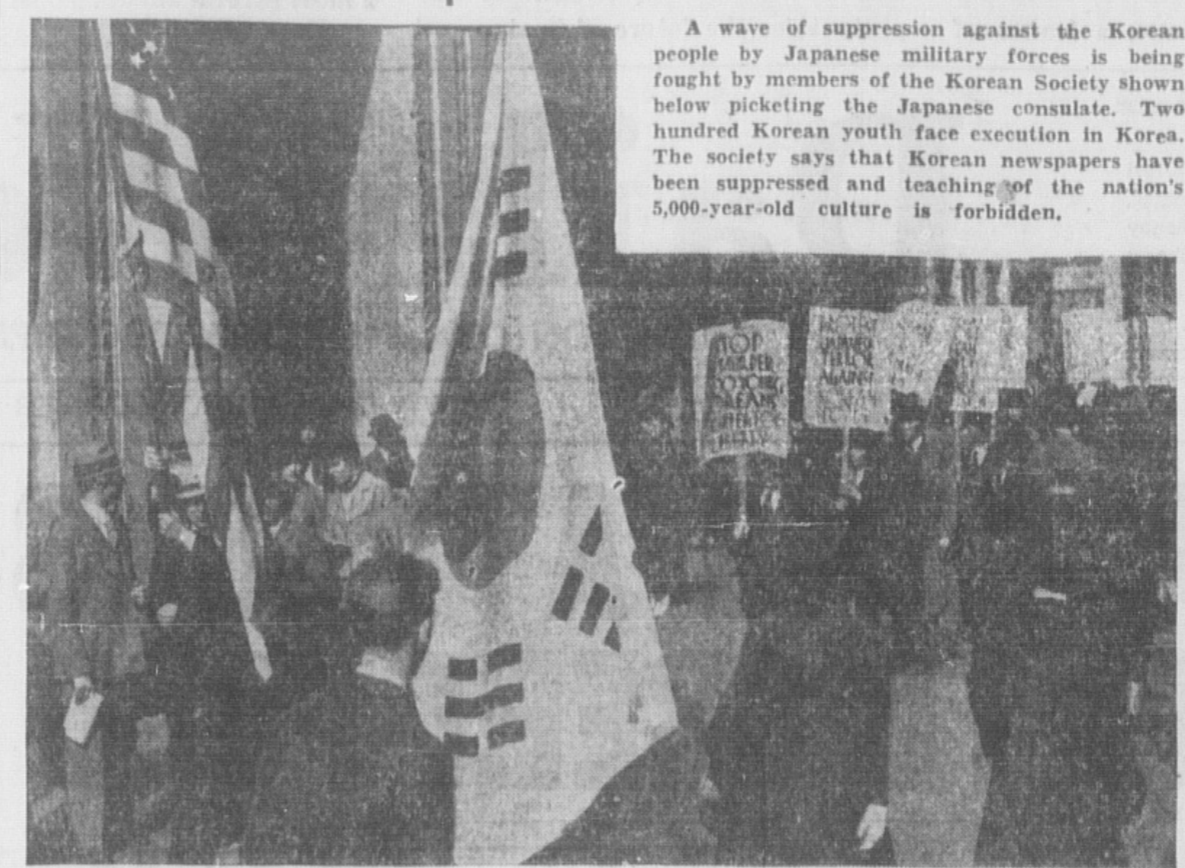
A wave of suppression against the Korean people by Japanese military forces is being fought by members of the Korean Society shown below picketing the Japanese consulate. Two hundred Korean youth face execution in Korea. The society says that Korean newspapers have been suppressed and teaching of the nation's 5,000-year-old culture is forbidden.