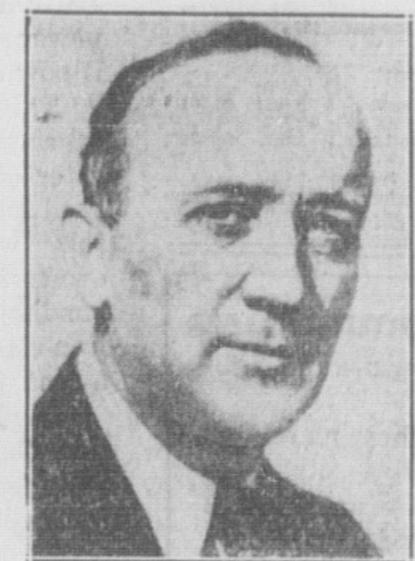
WILLIAM Z. FOSTER

'Mother' Bloor To Give Three Chicago Talks