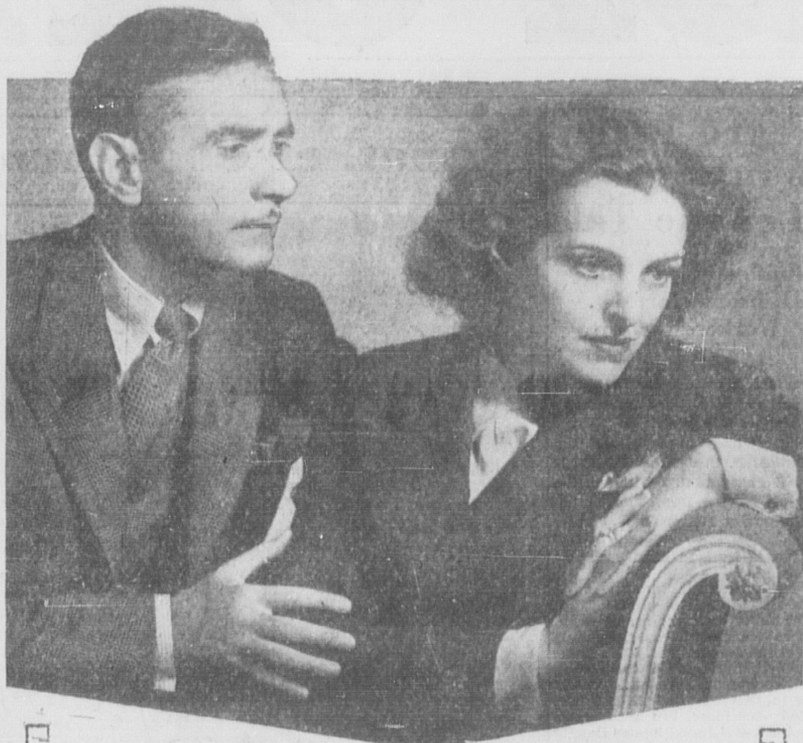
Clifton Webb, ex-dancer, and Helen Gahagan, sometime singer, are the dramatic stars of the Theatre Guild's first play of the season, "And Stars Remain." It is about a bold bad Republican and his vagrant grand-daughter and may be seen at the Guild Theatre.