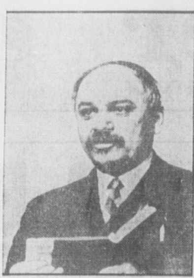
I. MAISKY Soviet Ambassador to Great Britain

When Maisky's statement, declaring that the Soviet Government would carry out non-intervention only to the degree done so by the other signatories of the non-intervention pact, was broadcast over the Soviet radio network, the night shifts in factories throughout the Soviet Union rallied in great mass meetings. The next day entire factories expressed their support for the Soviet Government's stand in huge mass meetings in the factories.