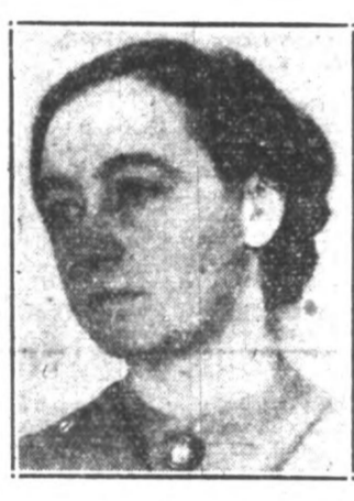
JOSEPHINE HERBST Noted novelist, author of "The Executioner Waits"