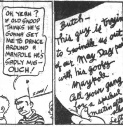
OH YEAH? IF OLD GNOOP THINKS HE'S GONNA GET ME TO DANCE AROUND A MAYPOLE HE'S SADLY MIS-OUCH!

Butch - This guy is trying to swindle us out of our May Day pay with his goofy Maypoles. Call your gang for a special meeting this Saturday.