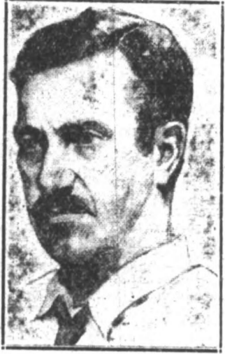
EARL BROWDER General Secretary of the Communist Party, U. S. A.