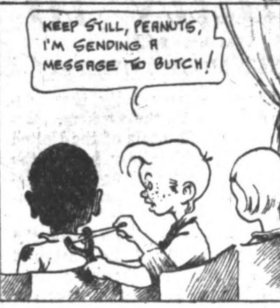
KEEP STILL, PEANUTS, I'M SENDING A MESSAGE TO BUTCH!