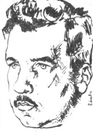
MALCOLM COWLEY Poet, critic, and literary editor of the New Republic