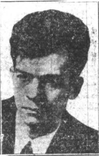
MICHAEL GOLD Outlining revolutionary novelist and Daily Worker columnist