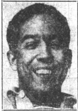
LANGSTON HUGHES Famous Negro poet, short story writer and novelist