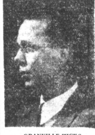
GRANVILLE HICKS Literary editor of the New Masses, critic, and author of "The Great Tradition"