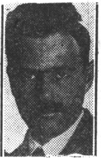
WALDO FRANK Well-known novelist and critic, and author of "The Birth of David Markand."