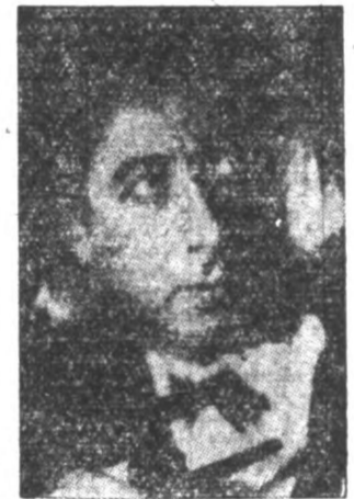
M. NADIR World-famous Yiddish-American poet