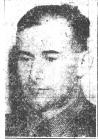
FRIEDRICH WOLF Exiled German playwright, author of "Sailors of Cattaro"