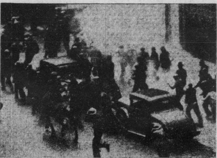
The "servants of the people" serves the people again—with bullets and tear gas. Scene shows San Frisco longshoremen getting served double portions of bullets and vomit gas from the police.

In the Jordan district pavements had been completely disappeared having been broken by the militant workers Wednesday night, last night, and today.