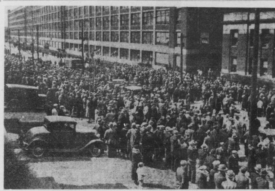
THE POWER OF UNITY Detroit auto workers on a mass picket line in front of the Briggs auto plant during the strike last spring. Unity is the need of the hour for the auto men. They should fight for one united industrial union.

By WILLIAM W. WEINSTONE THE first national conference of the United Automobile Workers Union—that is the federal locals of the American Federation of Labor—has come and gone. This conference was called upon practically one week's notice. The call for the conference was in the hands of the officialdom of the locals one month before the conference but was purposely withheld for three weeks in many of the locals in order to prevent the rank and file from rallying their forces for the conference. The main problems of the automobile workers remained unsolved by the conference.