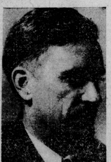
EARL BROWDER General Secretary, Communist Party, U. S. A.

On every hand, the capitalist forces are sharpening their attack on the living standards of the American working class. In meeting this attack, the Communist Party must be able to speak daily to these workers in the language of the majority. As the Central Organ of the Communist Party, U. S. A., our Daily Worker is the Party's official voice—the educational and rallying influence that clarifies and emphasizes the importance of our struggles.