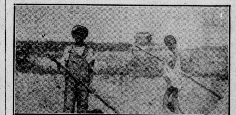
THEIR YOUNG LIVES BROKEN—Even little children are forced to work on the slave plantations operated by the white exploiters of the South. Hoover and Roosevelt both talk a lot about "child welfare," but they say nothing about this savage exploitation of thousands of children, especially Negroes. Photo shows two Negro children chopping cotton in Alabama. The one on the right is only five years old!