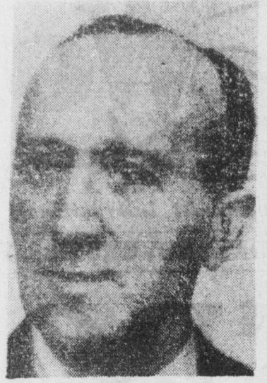
Wm. Z. FOSTER, Candidate for President.