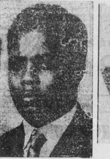
JAMES W. FORD, Candidate for Vice-President.