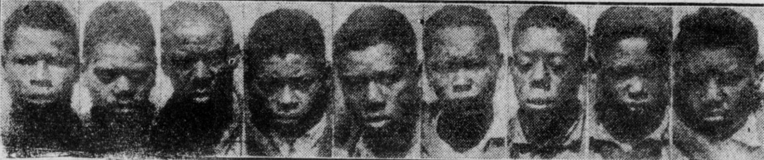
The nine Scottsboro boys in whose defense millions of workers, peasants and intellectuals throughout the world have held numerous protest demonstrations. Reading left to right, they are: Anderson Wright, 17 years old; his brother Roy, 14; Haywood Patterson, 17; Eugene Williams, 14; Willie Roberts, 17; Olen Montgomery, 17; Clarence Norris, 19; Charlie Weems, 20, and Ozie Powell, 14.