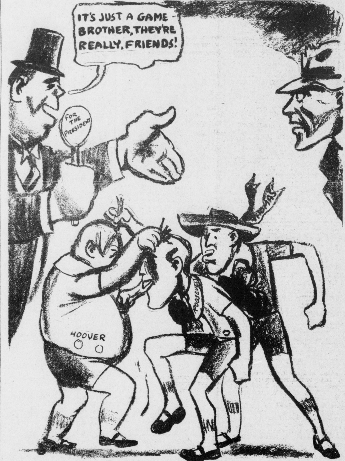
"THE SHAM BATTLE GETS LOUDER!"

Most Important Election Since Civil War, Says New Ford-Foster Committee