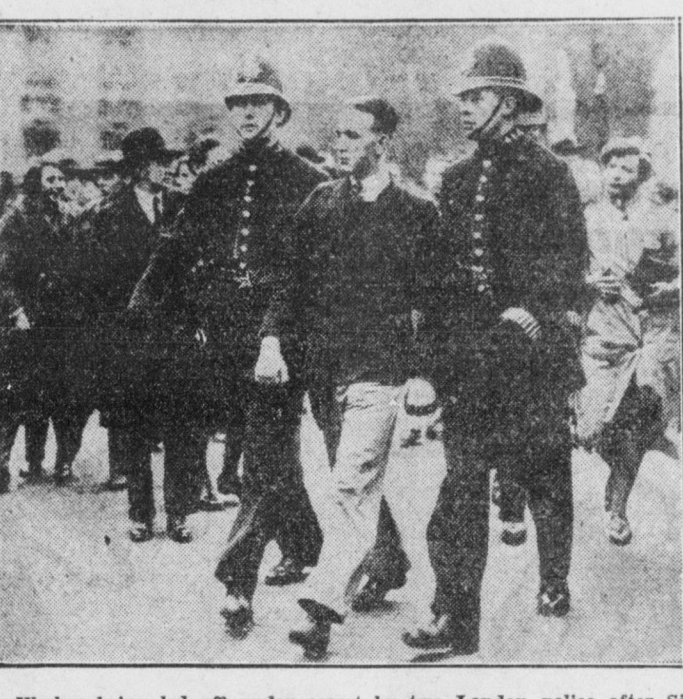
Worker being led off under arrest by two London police after Sir Oswald Mosley's Fascists had clashed with the unemployed at Trafalgar Square, and the workers had won the battle. Mosley is a former Labor Party leader, when he was a member of Parliament, and at that time Macdonald's right-hand man.