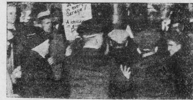
Part of the 8,000 workers (including many jobless and war veterans) who met Hoover at the station in a demonstration against the hunger program of the government. Photo shows Detroit police showing the demonstrators back.