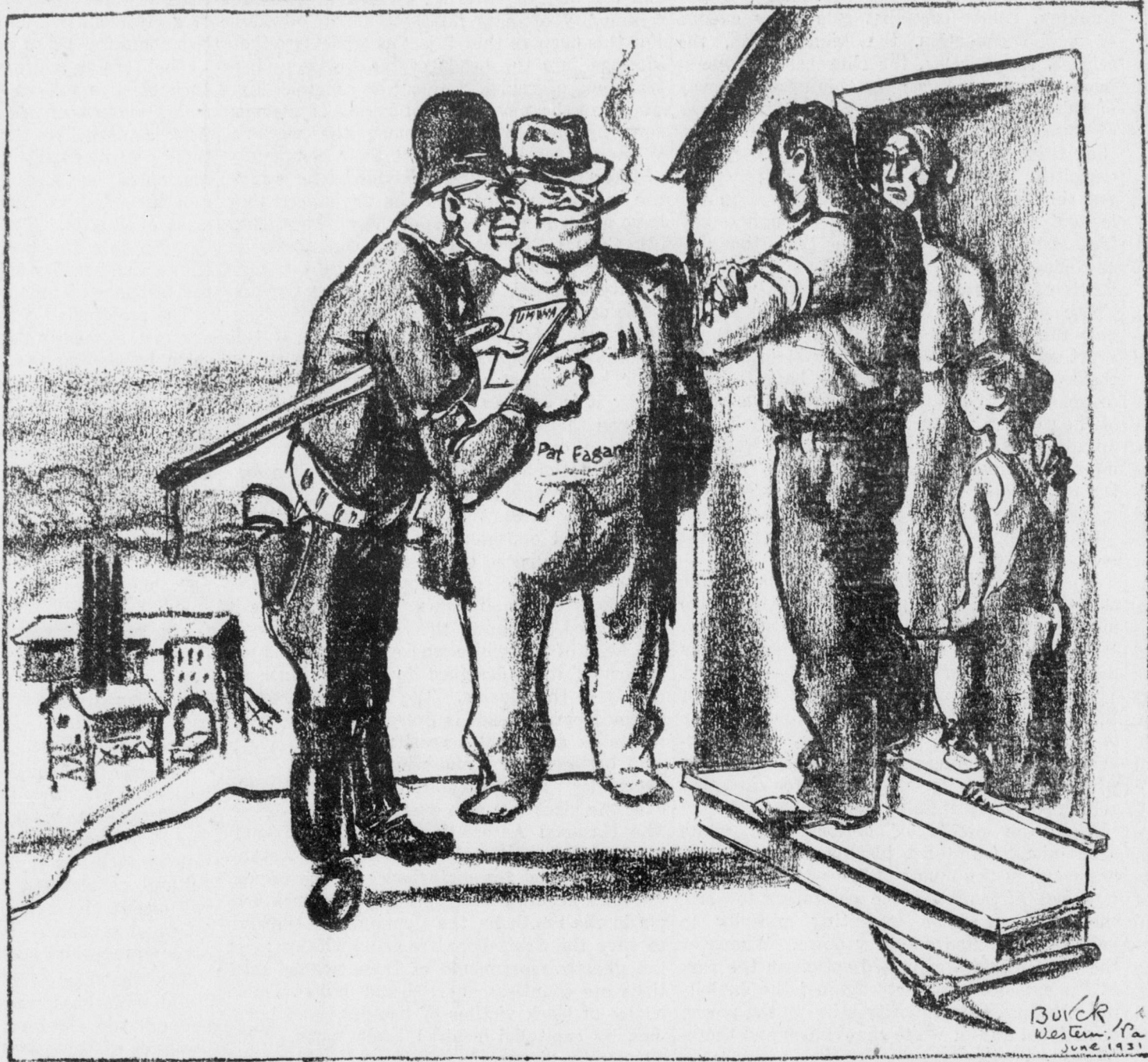
NEWS ITEM:—State police going from door to door trying to get miners to join the U.M.W.A.