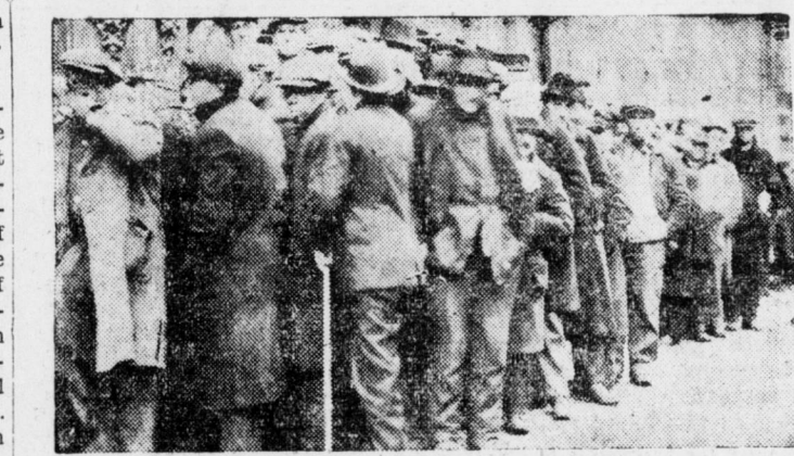
Hunger lines in capitalist America. And the bosses still have the brass to boast about the "superiority" of the capitalist starvation system over the Soviet system of workers' rule!

The first of the series of important topics to be discussed at the Forum will be "The crisis of capitalism, and the American workers' discussion led by Max Bedacht, head of the national agitation-propaganda department of the Communist Party and director of the Workers School.