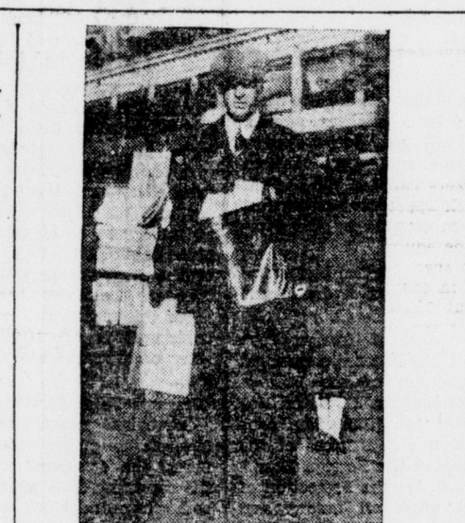
Here is a Seattle worker who sells 50 copies of the Daily Worker every day on Seattle streets. Workers can always buy the Daily Worker at 4th Ave. and Pike Streets and Third Ave. and Pike Street.

Connecticut added 79 readers during the five days recorded. This is the highest increase. Detroit came next with an increase of 56. Seat-