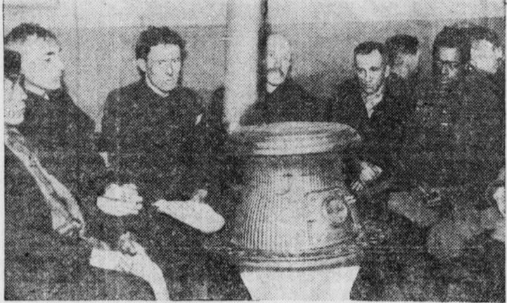
After the smoke of the countless fake promises made by the bosses before election lifts we find bigger headlines, more evictions, more suffering among the families of the unemployed, more arrests of jobless as "vagrants."

Fight these miseries forced upon the jobless by the bosses and their political parties! More and larger unemployed demonstrations. Join the Unemployed Councils and prepare to march on the bosses' Congress with a million signatures to demand that immediate, tangible relief be given.