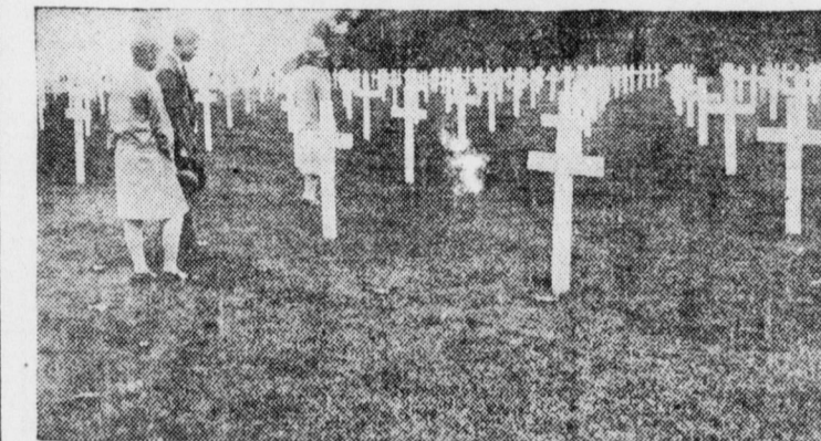
Rows of crosses in Flander's Field: Capitalist reward to the masses it kills in its robber wars for profits.

And for what? For the profits of the capitalist class! For the security of Morgan's loans of $4,000,000 made to the Allies that caused America to enter the war at a time when German victory seemed likely to endanger those loans!