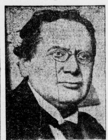
MAXIM LITVINOV, Soviet delegate to "Preliminary Disarmament Commission," who showed up the boss war preparations and their refusal to disarm.