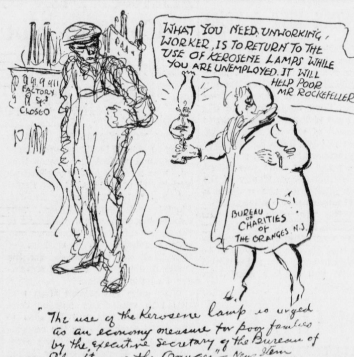
The use of the kerosene lamp is urged as an economy measure for poor families by the executive secretary of the Bureau of Charities of the Orange - New Haven