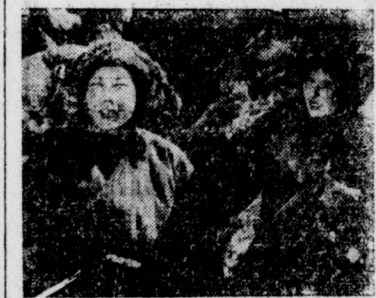
The Mongolian workers in a victory celebration scene in "Storm Over Asia," now showing at the Cameo Theatre.

The Mongolian government co-operated with the director of "Storm Over Asia," now showing at the Cameo, Vsevolod Pudovkin, when the latter was on location in Mongolia. For instance, when Pudovkin wanted to film a big episode of the picture—a sort of trouncing of colors—it was staged with the assistance of the Mongolian government. The latter let it be known that on a certain day there would be held horse races, wrestling matches and an exhibition of airplane flying. In response, 3,000 horsemen came to take part in the display.