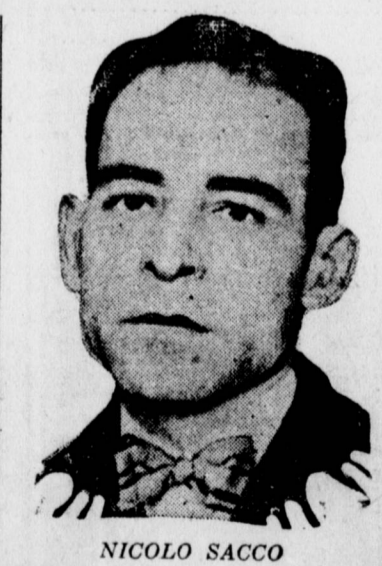
On the third anniversary of Sacco and Vanzetti, the working class must burst forth in a tremendous storm of protest and demand that the Atlanta six be saved from the electric chair. The working class does not need martyrs. We must keep our fighters on the outside to continue the struggle against the system of exploitation, speed-up, unemployment and war.

The United Press dispatch from (Continued on Page Three)