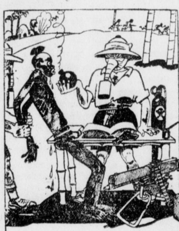
British imperialism is bombing and gassing the Afghans and Indians around Peshawar. At the same time, British planes and guns supplied to the Kurds are being used to prepare war against Turkey—then against the Soviet Union.

NEW YORK.—Automobile production for the first six months of 1930 declined 39 per cent in the U. S. as compared to the same period of a year ago.