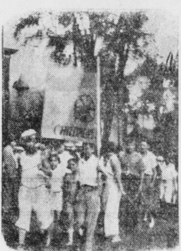
Pioneers Arriving at August 1 Demonstration in Detroit.

All Labor Defender Agents and I.L.D. functionaries must report at the district office, 799 Broadway, in Room 410, any time during the day. All other members of the I.L.D. who are unemployed should report also.