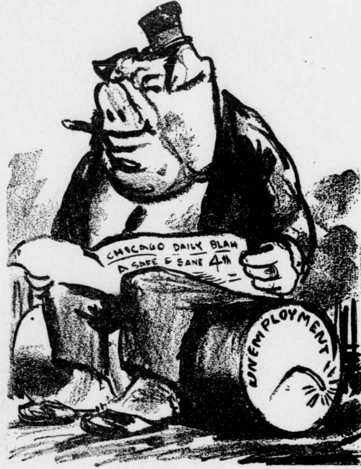
—By FRED ELLIS