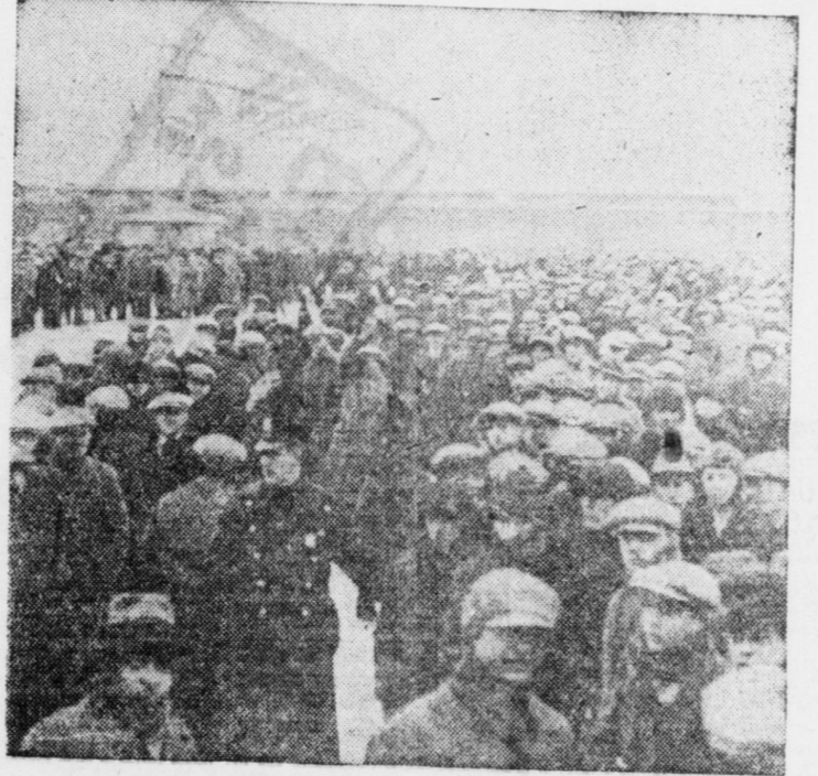
A crowd of jobless workers, estimated at 25,000, that stormed the gates of the River Rouge plant of the Ford Motor Co. in search of jobs in order to live. The workers were beaten back with brutal savagery by the police and company guards.

The National Convention of the Unemployed, now meeting in Chicago, will lay the basis for organization of millions of jobless workers for bitter struggle that will wrest bread from the bosses and their government that want to starve them.