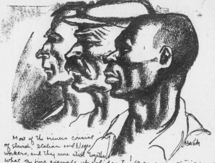
Most of the miners consist of several Italian and Negro workers, and they have stuck together what a fine example of solidarity! (Sketch was made in Pinedale)