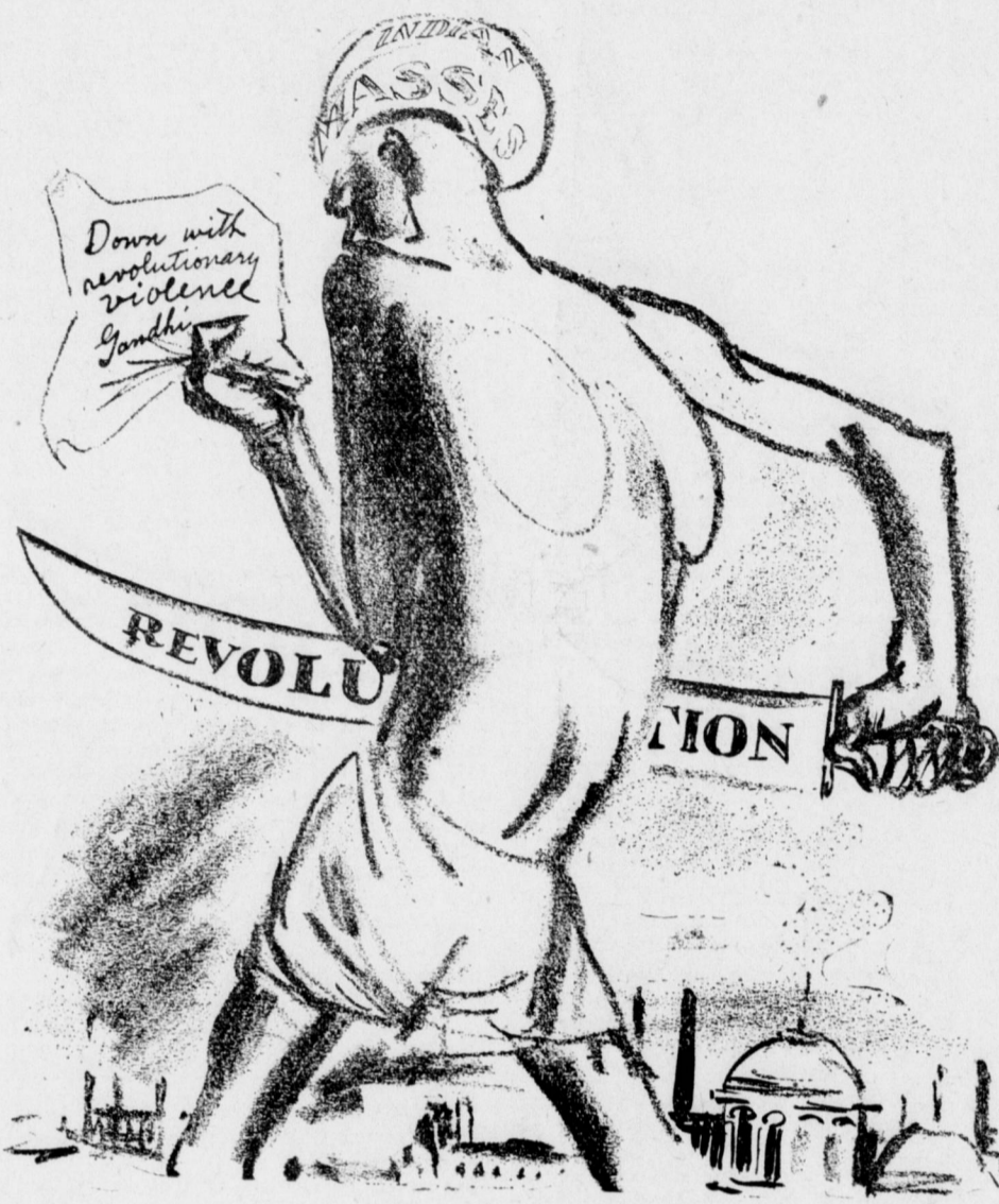
By FRED ELLIS