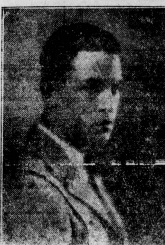
Who plays the title role in Arnold Gweig's anti-military story "The Case of Sergeant Grischa," at the Globe Theatre.