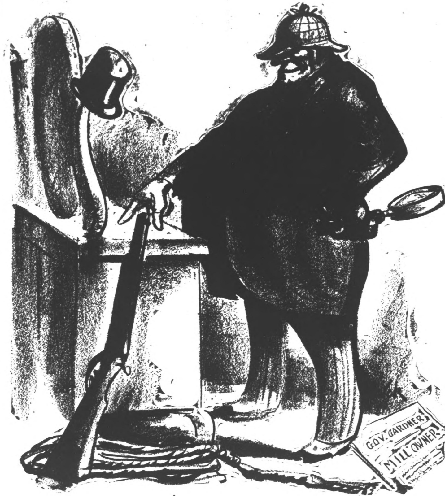
County Solicitor Carpenter (after a hard day's lynching): "Now We'll Investigate!"