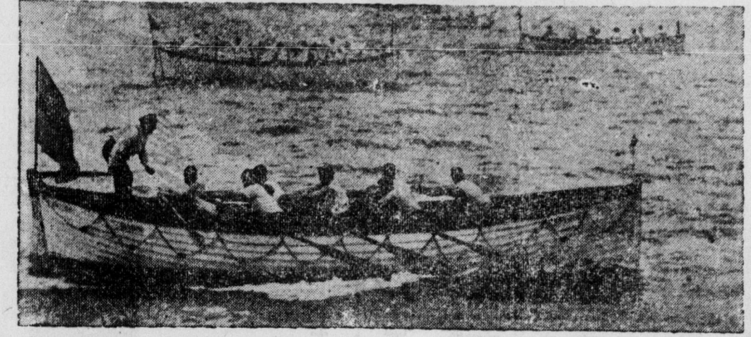
Seamen from the crew of the S.S. Mauretania winning first place in the international lifeboat races. Swedish and American seamen took second and third places respectively,

To Seamen, Victory; To Imperialists, Publicity