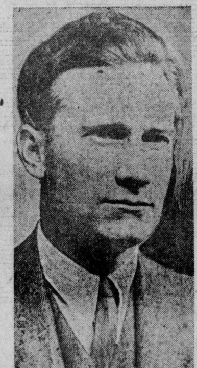
JAMES P. CANNON.

The Communist Party which period of increasing and expanding the revolutionary struggle breaks struggles of the workers. With this with all these conceptions of organiperspective before us, the problem of tightening up the party machine and strengthening its capacity to shape zation and carries on a continuous struggle to extirpate their remnants from its ranks. Such a Party must know its forces and be able to estiand guide these struggles acquires a mate correctly their capacities and mobilize them for action. The assignment of definite tasks to every Socialist Party Members Passive. party member and the construction of It is a well known fact that Bolsheism clashes with reformism on ormittees to supervise and regulate this work is the Communist organiganization questions no less decisively zation principle. This leads to the than on points of general politics. The construction of a flexible but strong