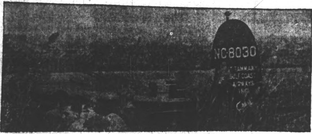
A huge new U. S. army plane, one of the many recently constructed in preparation for imperialist war, crashed Sunday at Teterboro airport. Photo shows plane after crash.