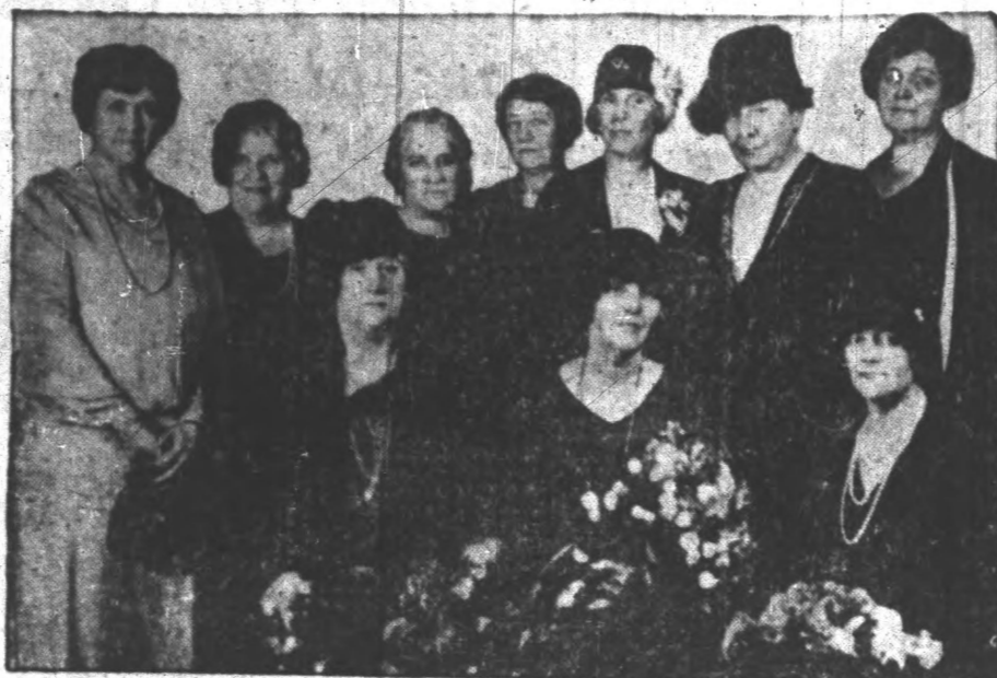
It's all part of the game—the great game of hariboosting the workers. Above: Mrs. Hoover, who only claim to distinction is that she happened to marry the man who will probably be Wall St.'s chief politician in the House. Mrs. Hoover is in the center, seated. To her left is Mrs. Alanson D. Houghton, wife of the republican candidate for U. S. senator from New York.

take place. He declared that Altamirano had released many prisoners after warning them against Moncada's candidacy in the election.