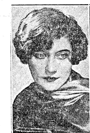
With Roland Young in "The Queen's Husband," Robert S. Sherwood's clever satire at the Playhouse.