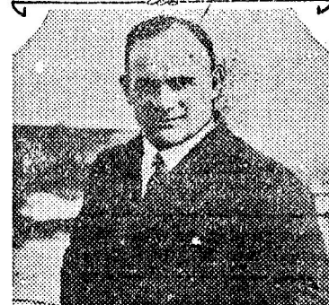
The Fatherland is trying an imperialist publicity come-back by encouraging Captain Herman Koehl, above, pilot of the plane, Bremen, to cross the Atlantic. Koehl is accompanied by a former crown prince of the former crown prince.