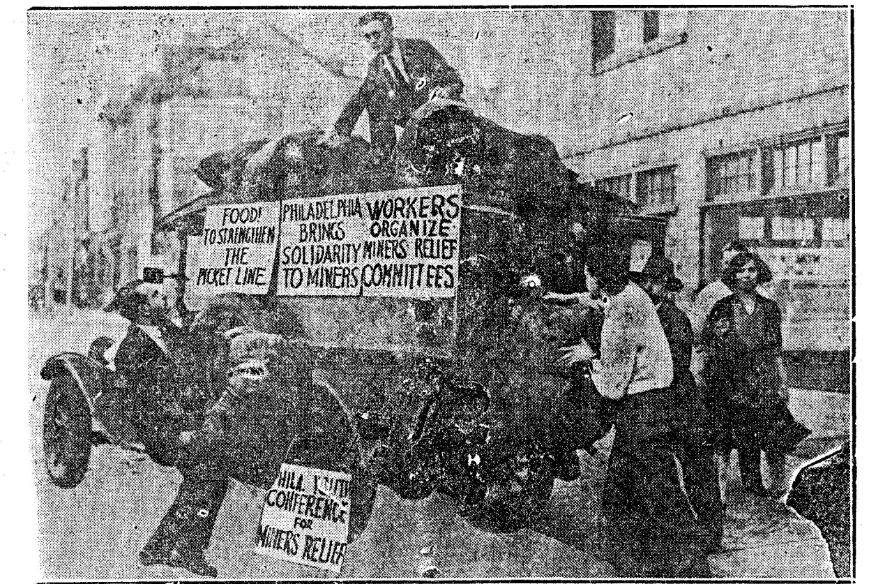
The Philadelphia Youth Conference, composed of militant young workers of that city, have organized miners' relief caravans, and are now operating a regular relief service from Philadelphia to the strike coal regions. Photo above shows one of the trucks in the caravan being loaded with food and clothing, before its departure for the strike zone, in western Pennsylvania.