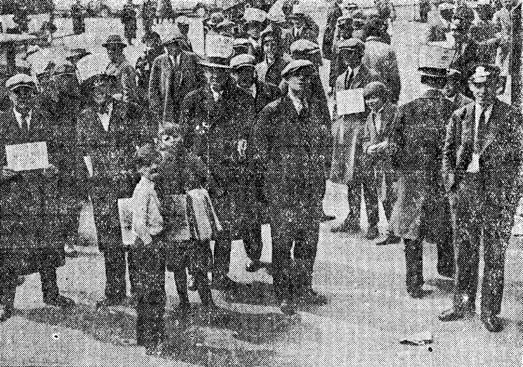
The solidarity of the taxicab drivers in Newark, who are striking for recognition, and better pay and working hours, has resulted in tying up practically every cab in Newark and its suburbs. The few cabs hired by the Yellow and Brown and White Companies have no licenses to drive cabs, strike leaders charged. A group of taxi strikers are shown above on the picket line.