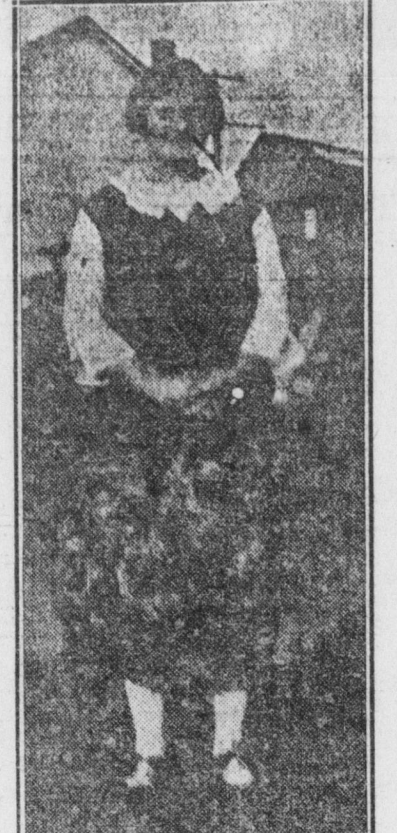
This woman's husband is a good union man. But she is the sort of healthy, courageous proletarian type that is the despair of coal and iron police trying to beat down the morale of the locked-out miners.