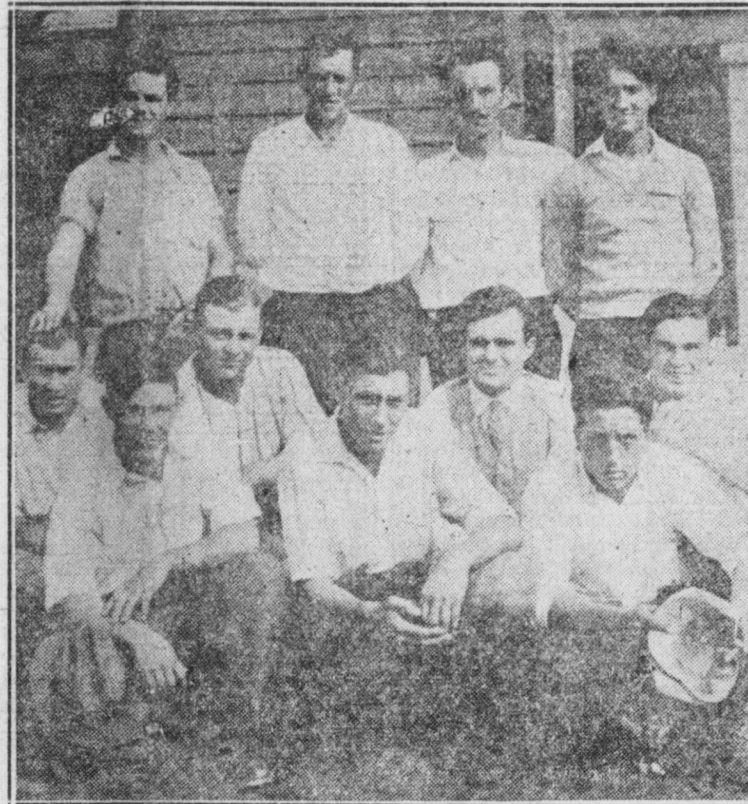
These young proletarians are on strike at Renton, Pennsylvania, the town in which the Pennsylvania state troopers recently broke in miners' houses and thrashed their wives and children. The Union Colliery superintendent ordered the assault.