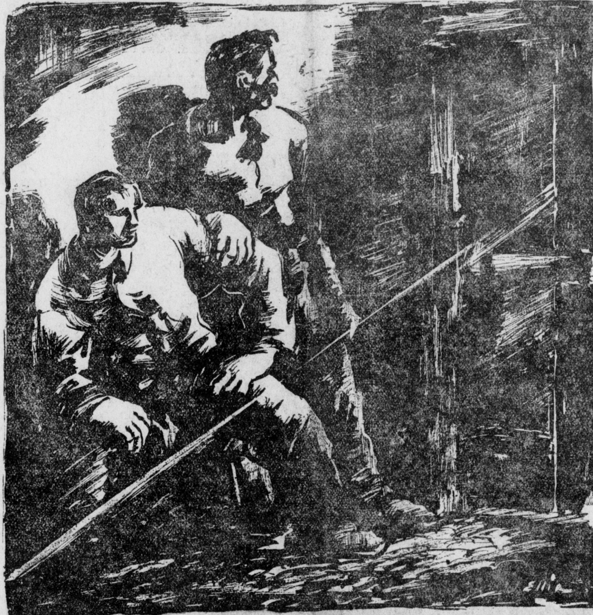
Sacco and Vanzetti hunger strike while Governor Fuller conducts his inquiry in secrecy.