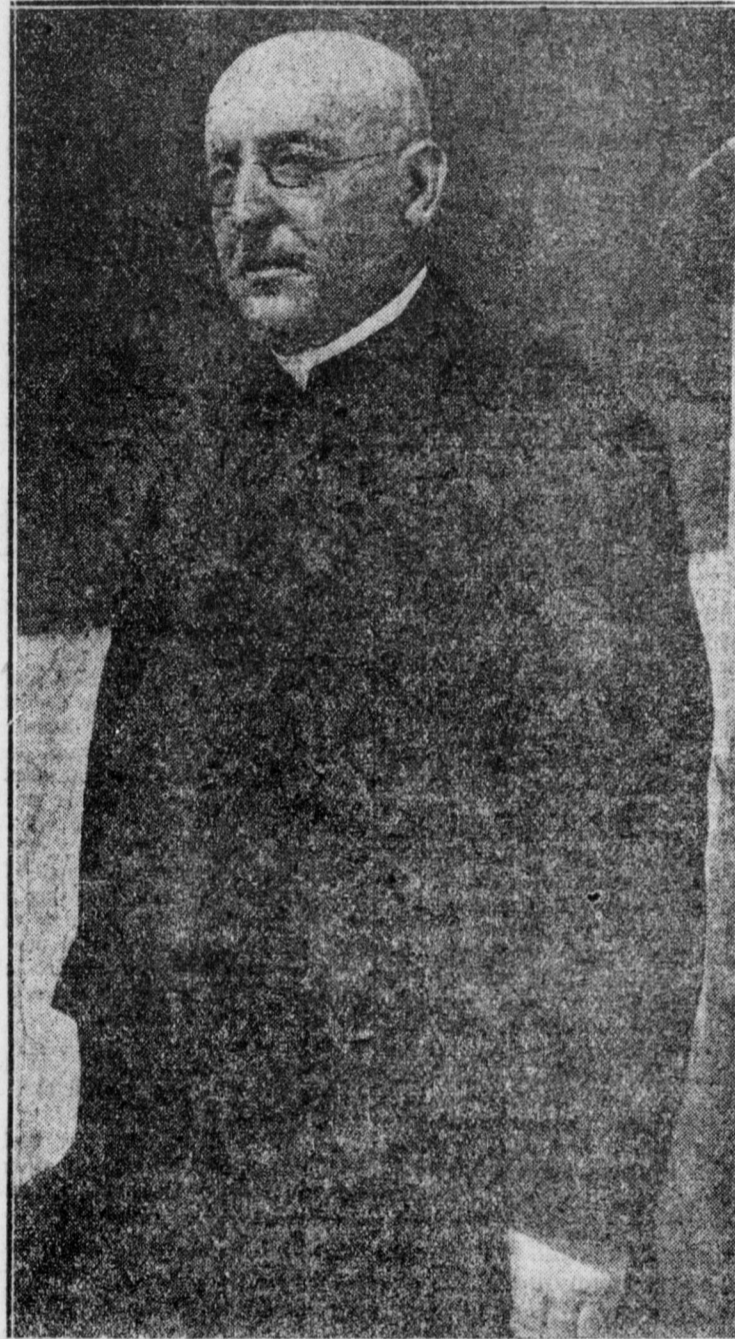
Monsignor Seipel, who holds his title from the Pope, and is a priest. He is also chancellor of Austria, head of the cabinet, and entrusted by the victorious governments in the world war, who really rule Austria, with the task of suppressing its workers.