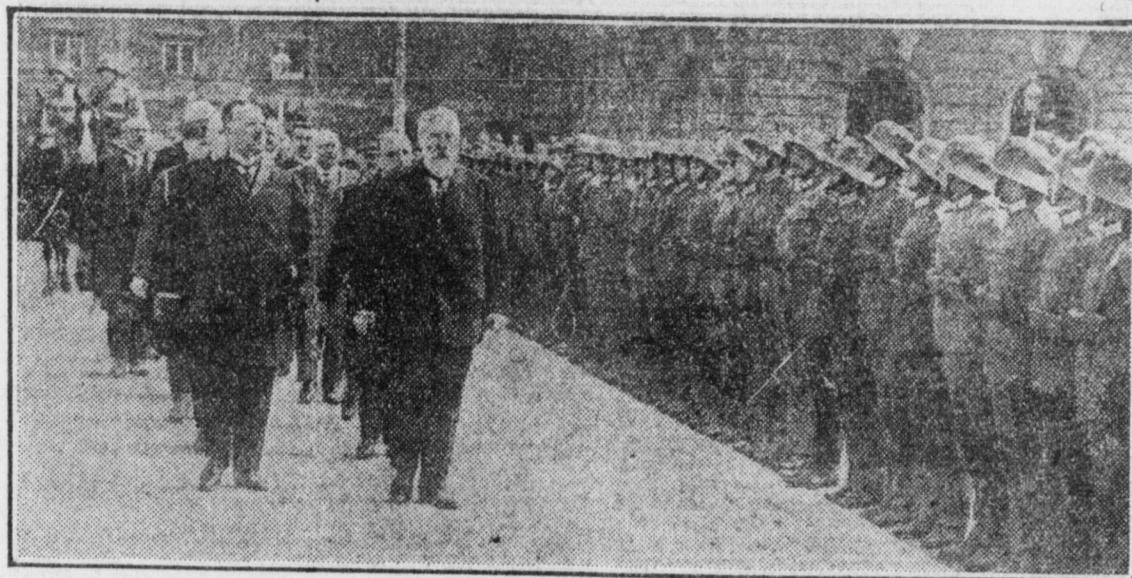
Austrian troops in the Vienna garrison, which refused to fire on the angry masses who attacked police and the palace of justice, have been replaced by troops from outlying garrisons. The above photo shows the Austrian President, Dr. Michael Hainisch, with the Minister of War, Herr Vaugoin, inspecting Vienna troops.