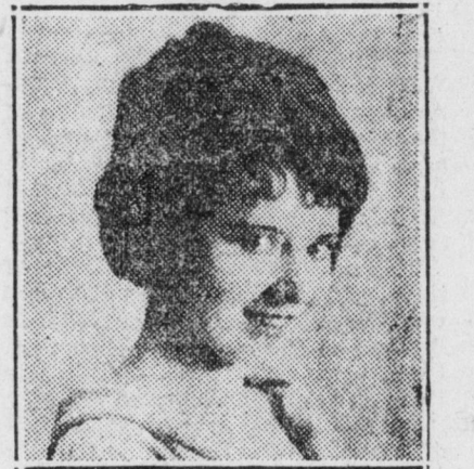
In "Naughty But Nice," a new film showing at Moss' Broadway this week.