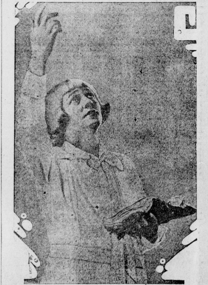
This Fresno, Calif. girl intended to go on the stage, but Aimee Semple McPherson, before her notorious "kidnapping" episode persuaded her there was more profit in religion. She preaches with considerable appearance of emotionalism, so much so that her sermons in the church of the reactionary fundamentalist, John Roach Straton, helped to convince part of his flock that he was leaning towards Holy Rollerism. It has also been charged several times that she becomes nervously unbalanced while in the pulpit. But the moron's fall for her in her tent by the Yankee Stadium.