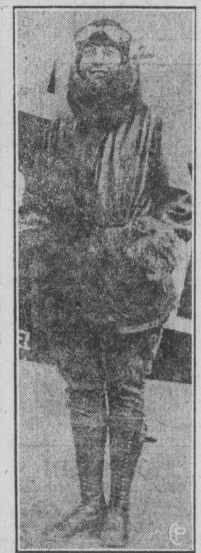
Fraulin Ina Raschke, noted woman flier of Germany, will try to break man's record in trans-Atlantic flight.