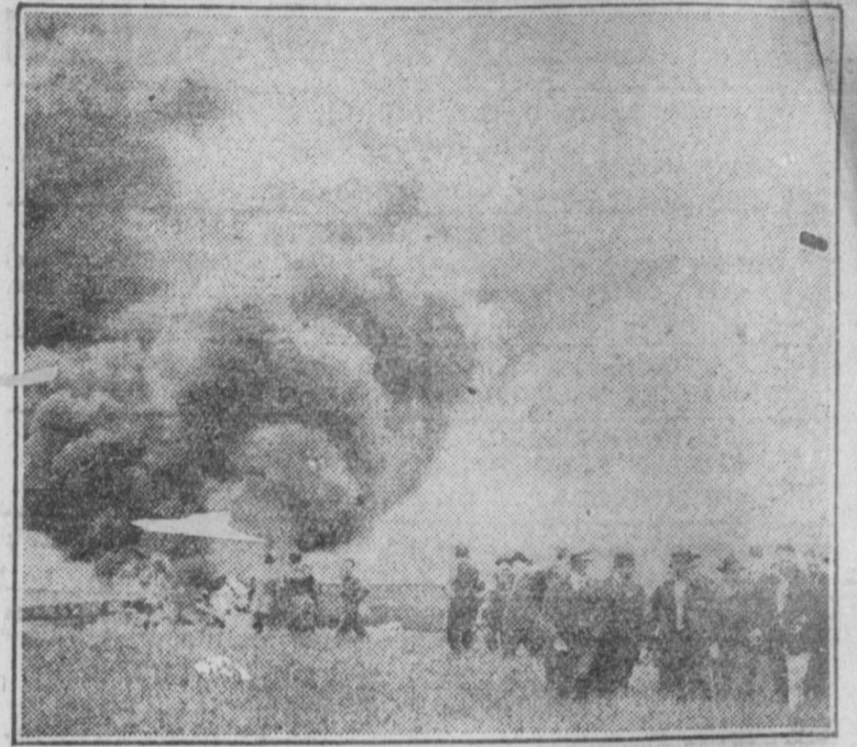
As they took off from Le Bourget flying field, Paris, on the start of a contemplated flight to India in an effort to establish a new long distance record, Captains Pelletier D'aisy and Gonin, noted French aviators, came to grief when their heavily loaded 650-horsepower biplane crashed and was completely destroyed. The photo shows D'aisy at the right with Gonin, leaving the burning plane.