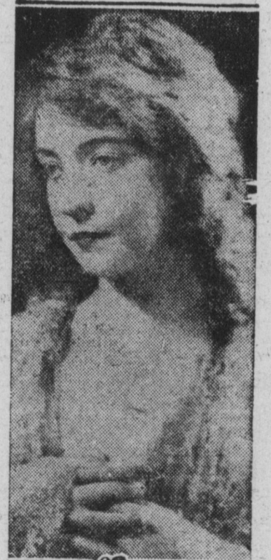
Is featured in "Annie Laurie" the new film at the Embassy theatre.

Margaret Anglin will not give her contemplated "Electra" at Jolson's theatre, as previously announced in these columns. Miss Anglin may give regular performances next season, however.