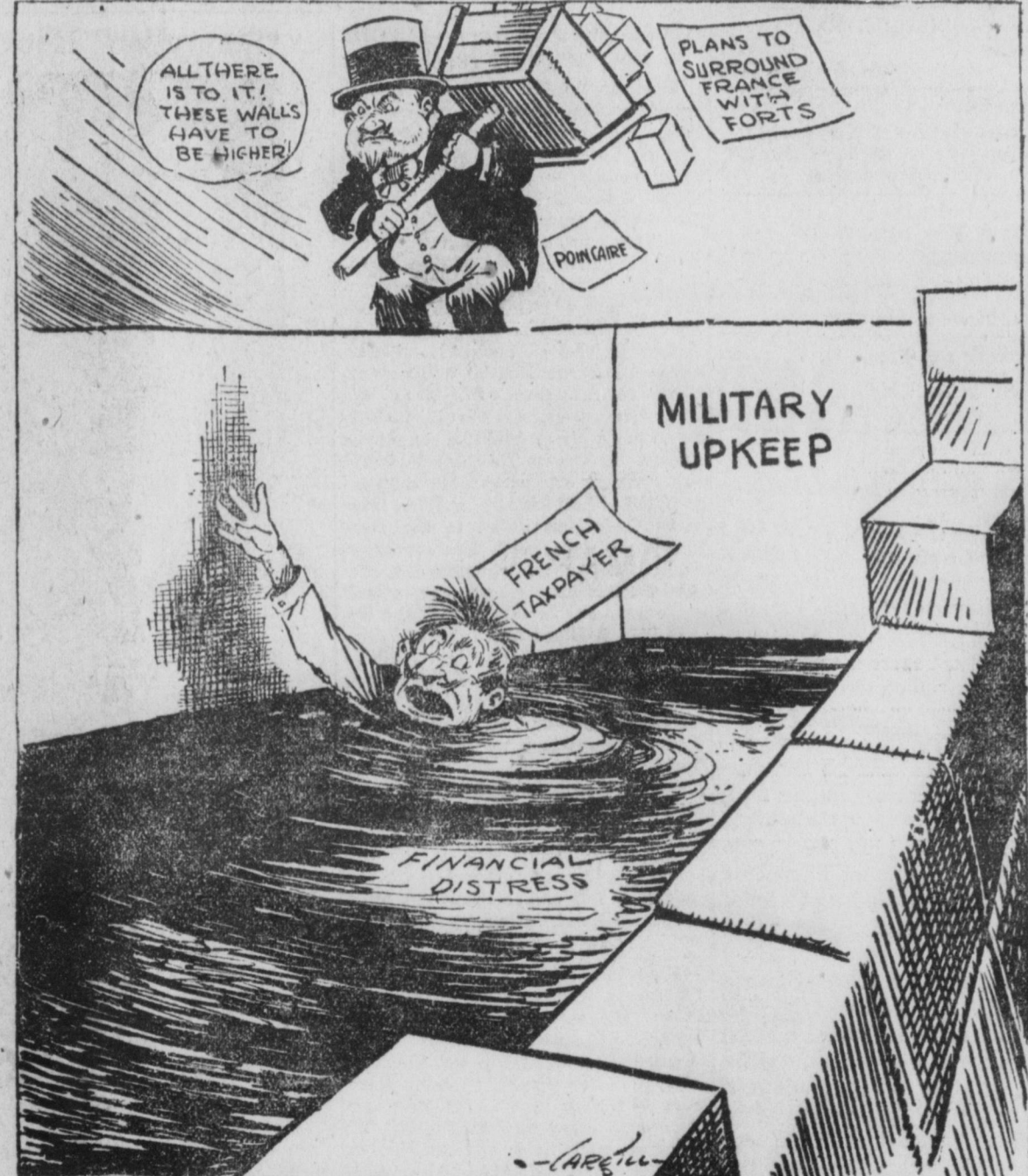
The French fat boys are in a most unfortunate predicament. Their scramble with the capitalist robbers of other nations for the world's gray forces them to build huge armaments and to make military preparations which overburdened French taxpayers can ill-afford.