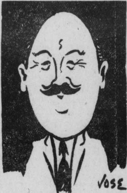
Speaker of the house of representatives, but better known as the husband of Alice Roosevelt.