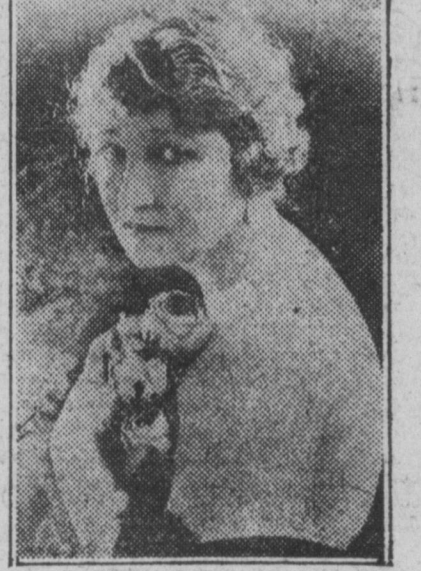
In "Restless Women", a new play, opening at the Bronx Opera House.

Earl Carroll's new play, "The Restless Women", will close on March 26 and begin a tour in Detroit on March 28th.