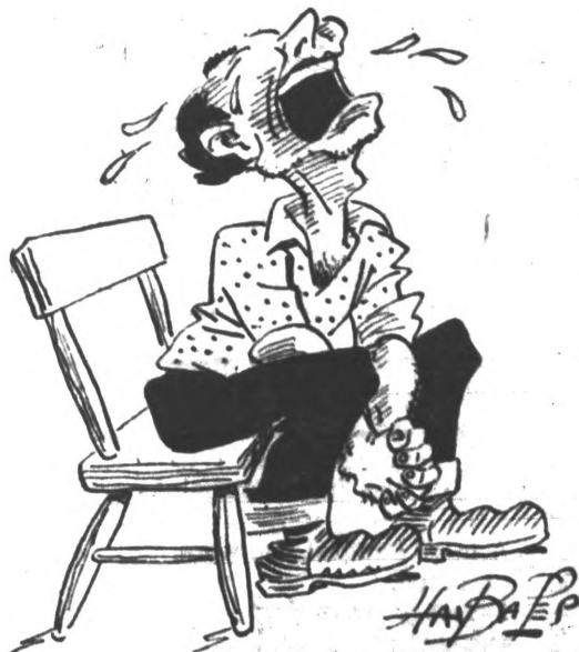
PICTURE OF WORKER WHO HAS BEEN EVICTED BECAUSE HE WAS UNABLE TO PAY THE RENT, WEeping OVER DEMPSEY'S HARD LUCK

The first period of trustification was over. Tribute was flowing in from foreign nations where the surplus profits of America's marvelous industry had been invested. The provincialism of the