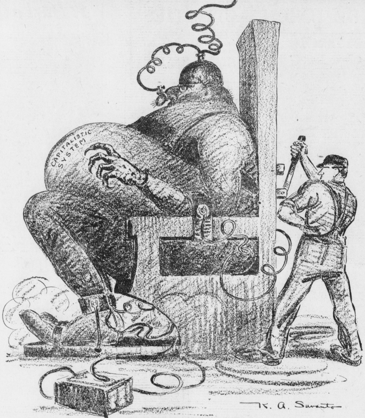
The real instigator of crimes is the Capitalist Society. It is the duty of the working class to take care of the execution of this system.