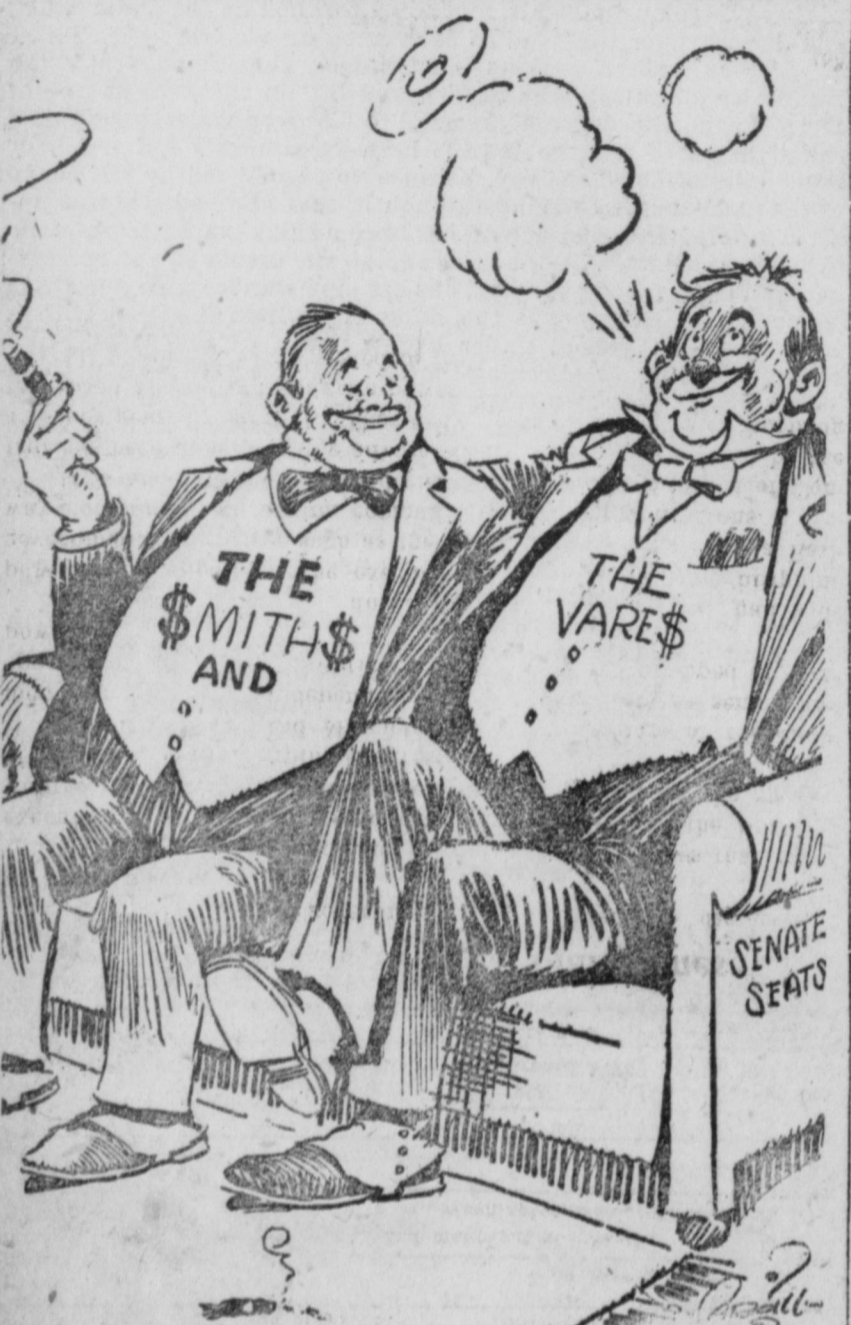
Vare of Pennsylvania and Smith of Illinois, having had their seats won for them at a cost of several million dollars, take their places in the senate and challenge their opponents to kick them out. They may be expelled—but this won't prevent the same thing happening again. The expulsion of Newberry didn't stop the game for Smith and Vare anyhow.