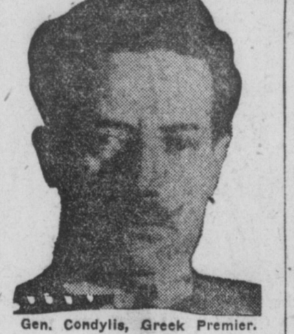
Gen. Condylis, Greek Premier.

The radical republicans under M. Papanastassiou, who came out just a