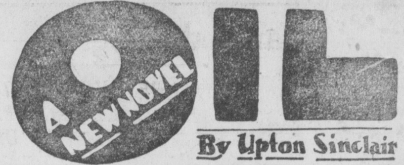
(Copyright, 1926, by Upton Sinclair)

The best way—subscribe today. DAILY WORKER.