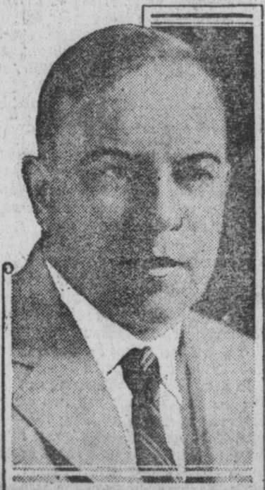
W.L. MACKENZIE KING

Above is Arthur Meighen, premier of the conservative government of Canada, who went to the people for a protective tariff to Canadian industry, what there is left to it was defeated in his own constituency, while Mackenzie King, leader of the liberal party, was re-elected on a low tariff platform and will assume the premiership at the next session of the dominion parliament. Three labor members of parliament were re-elected.