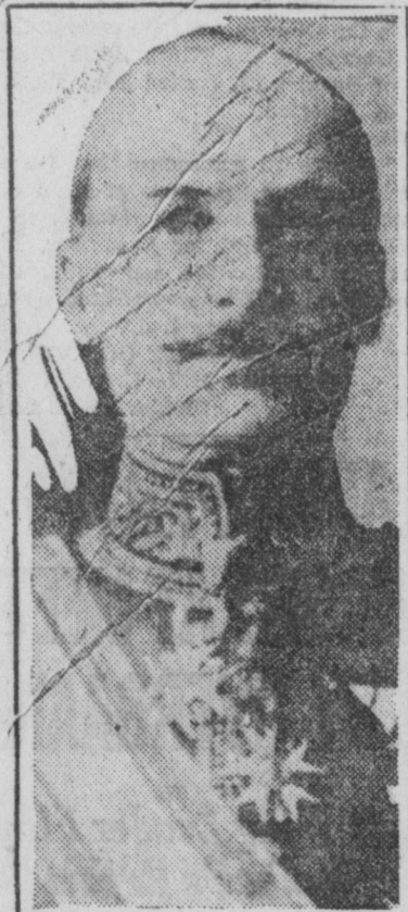
Alexander Padilla, Spain's ambassador to Portugal, will arrive soon in the United States to become the ambassador of the fascist government of a land ruled by a military junta in the interests of Spanish capitalists and landowners.