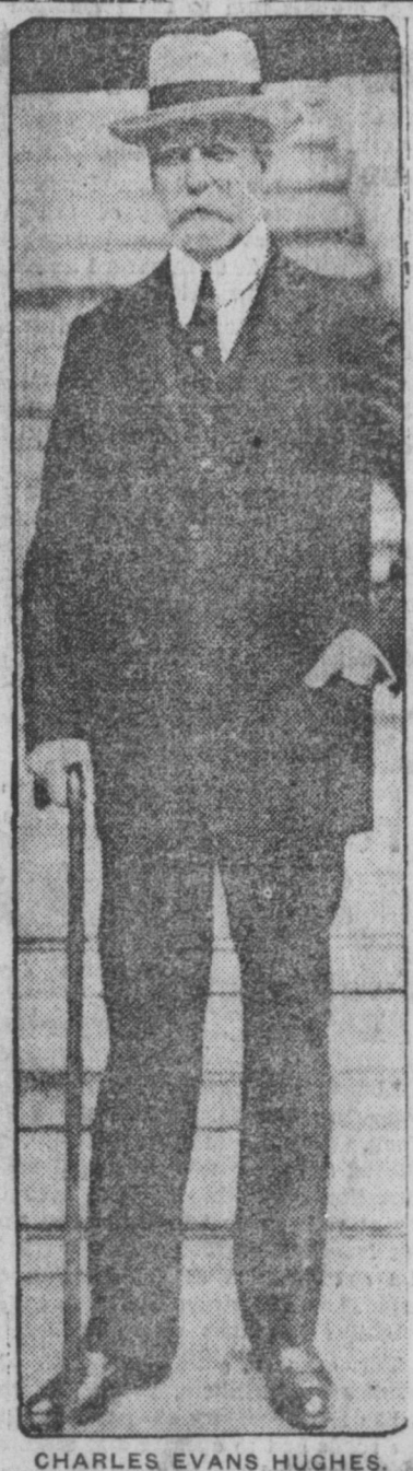
CHARLES EVANS HUGHES.

America's most famous corporation lawyer and former secretary of state is shown here on the steps of the ministry building in Paris after an audience with Foreign Minister Aristide Briand. These quiet trips of American ex-statesmen abroad are often reminiscent of similar journeys that Col. House used to make in the old days. In any case it is hard to believe that whiskered Charlie is merely having an outing abroad.