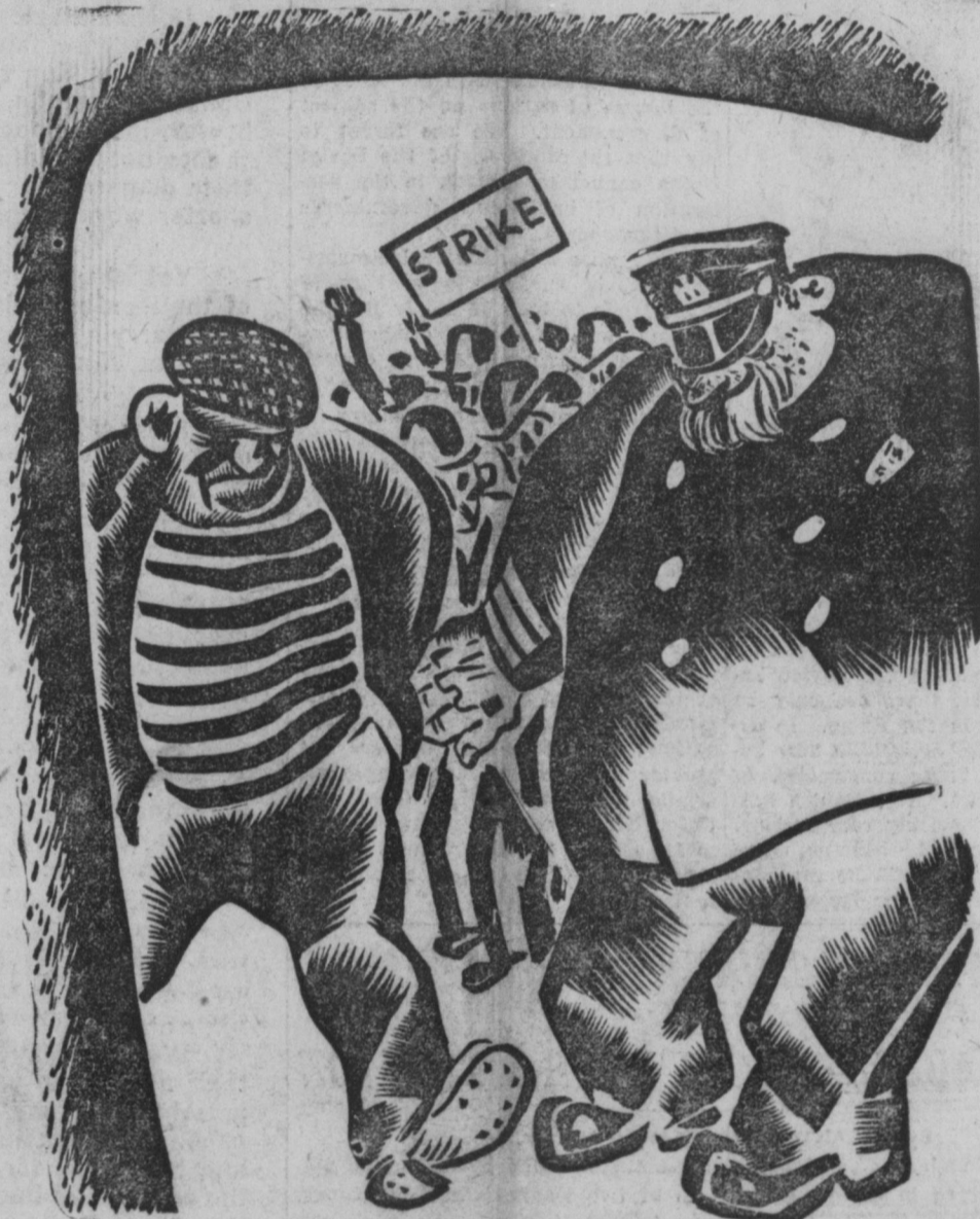
Why You Little Shrimp! Ya Better Say the Boss is Alright or I'll Bust Ya in the Nose!