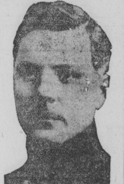
COMMISSAR OF WAR VOROSHILOFF

In his speech on the eighth anniversary of the formation of the army of the workers' and farmers' government he points out that the imperialist nations are planning greater and greater armaments—increasing their armies and navies—while the Soviet Union has reduced its standing army to 526,000 but stands prepared at any time to defend the union against invasion.