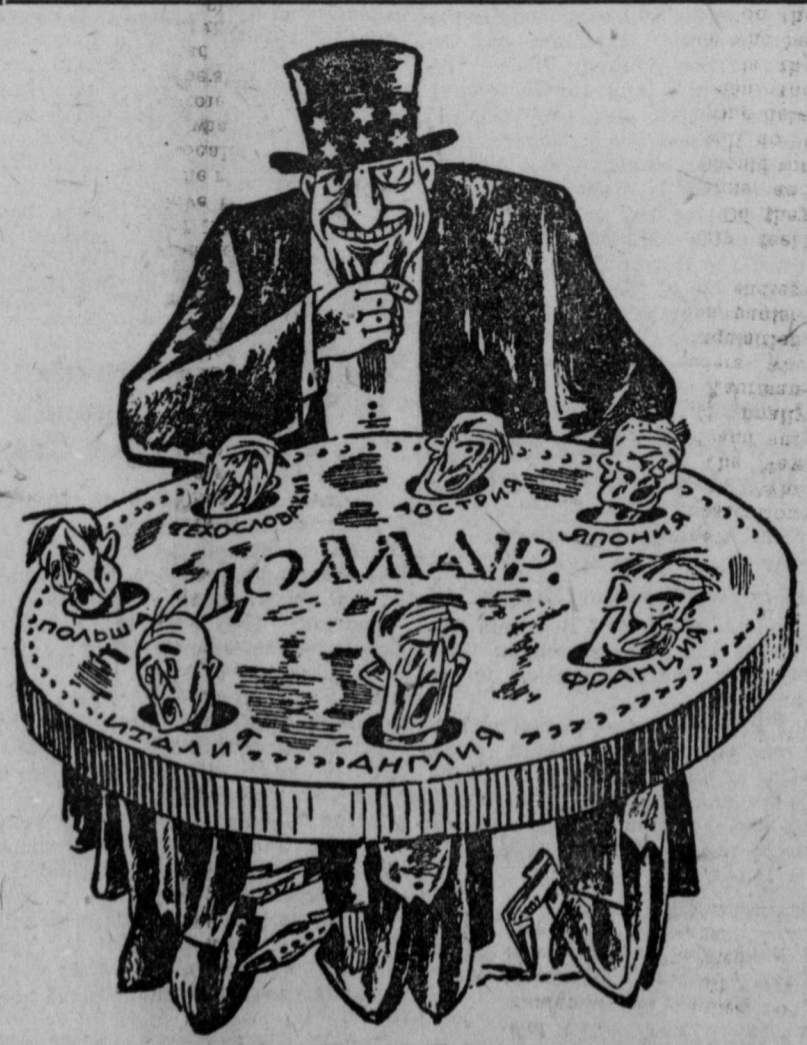
The "Saved." oviet cartoonist in the Russian Gudok (Whistle).