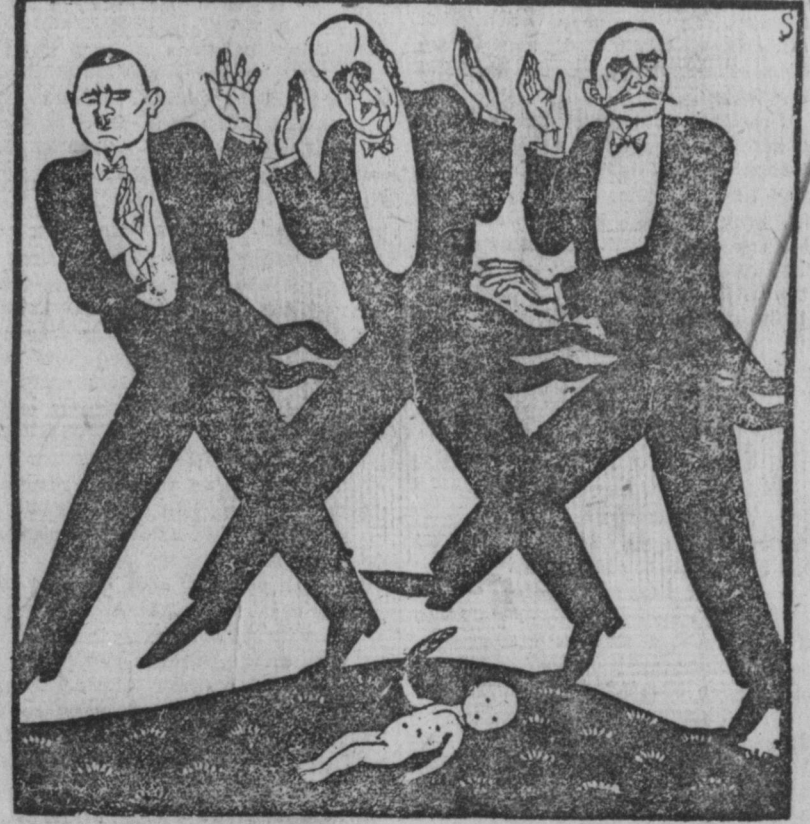
The nationalist parties of Germany denying their parenthood of the Locarno "peace" pact, altho they preferred it, and participated in its creation. (From Simplicissimus.)