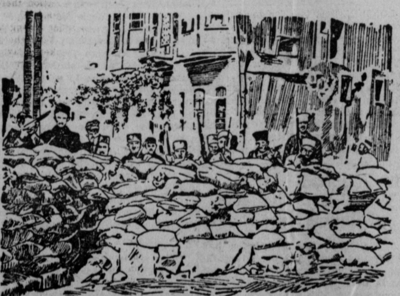
Syrian rebels fighting behind barricades against French imperialism.

ARICA, Chile, Dec. 14. - General Pershing made a vicious attack on Chile and its representative, Senor many foreign nations in circulation of Augustine Edwards for daring to ap- paper currency. Hungary took first peal against Pershing's position on place in a walk with a total of 4,513, Scotland Yard Head the matter of holding a plebiscite Feb- 898,560,000 krone, with France second ruary 1, 1926, instead of April 15, as with 40,603,965,000 francs. United proposed by Pershing. States has $5,320,946,000 in paper.