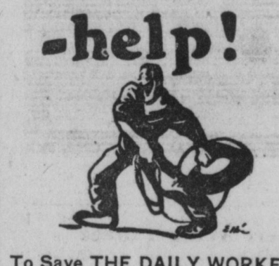
To Save THE DAILY WORKER

NOTICE TO CHICAGO MEMBERSHIP ALL general membership meetings on the unity question will be postponed for three weeks and will be listed beginning Dec. 21, according to instructions of the Central Executive Committee.