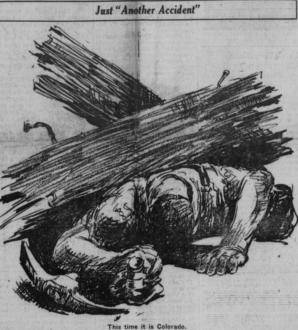
Just "Another Accident"

Altho company officials continue to assert there were only 18 men in the mine to the best of their knowledge other estimates varied widely, running as high as sixty.