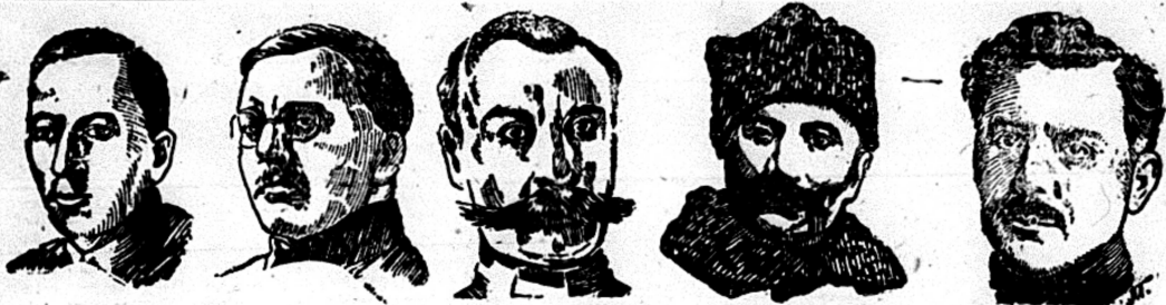
LEADERS OF THE U. S. S. R. RED ARMY—From left to right: Bubnov, Unshlicht, S. Kamenev, Budenny, Voroshilov.