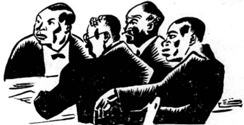
They felt rather lonesome but there will be more of them as the power of the left wing grows.

ists of today would consign him to the lowest depths of their phantom hell.