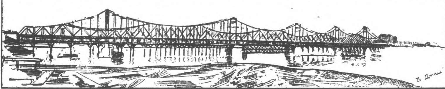
Another Monument to the Triumphant Struggle of Soviet Labor.

Other business taken up at this well attended and enthusiastic meeting included raising of a local ball fund and progress in the organizing of ex-service men for a determined campaign for the freedom of Crouch and Trumbull, imprisoned U. S. soldiers. It was decided to meet every Friday night until the national conference on June 28, at Greek Workers' Hall, 722 Blue Island Ave. Seek Time Saving Schemes. MOSCOW, June 14.—Leon Trotsky has been appointed chairman of the commission for raising the productivity of labor. In addition he also is a member of the presidium, or supreme economic council; chairman of the concessions committee and head of the scientific and technical branch of the supreme council. His first step in his new position today was to offer premiums to workers for labor and time-saving schemes.