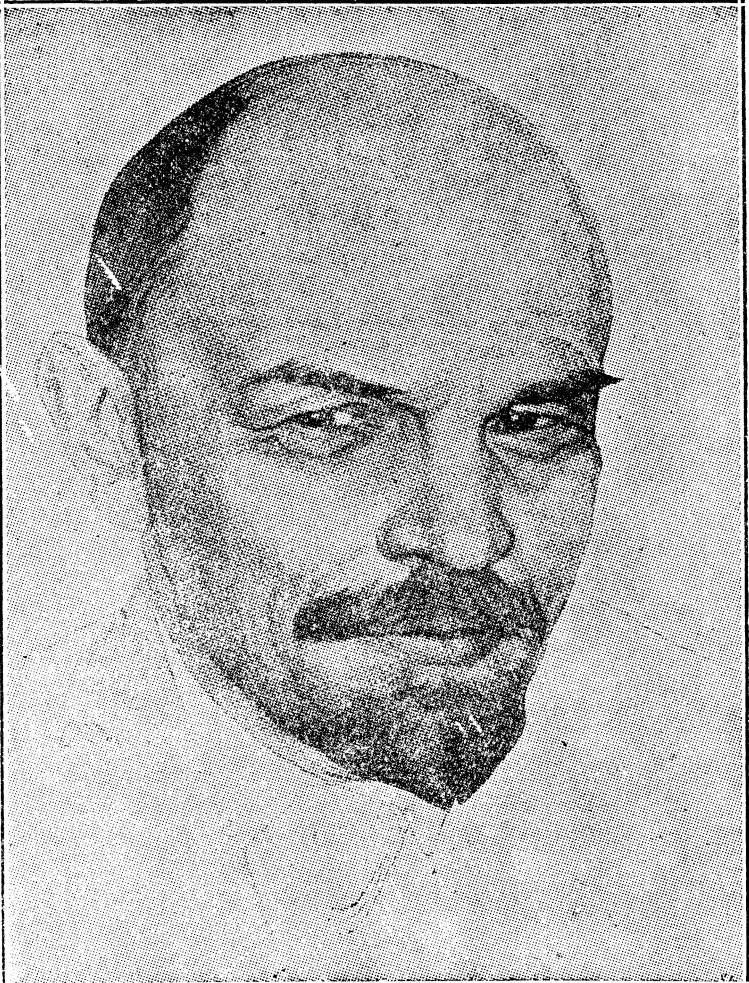
V. I. LENIN