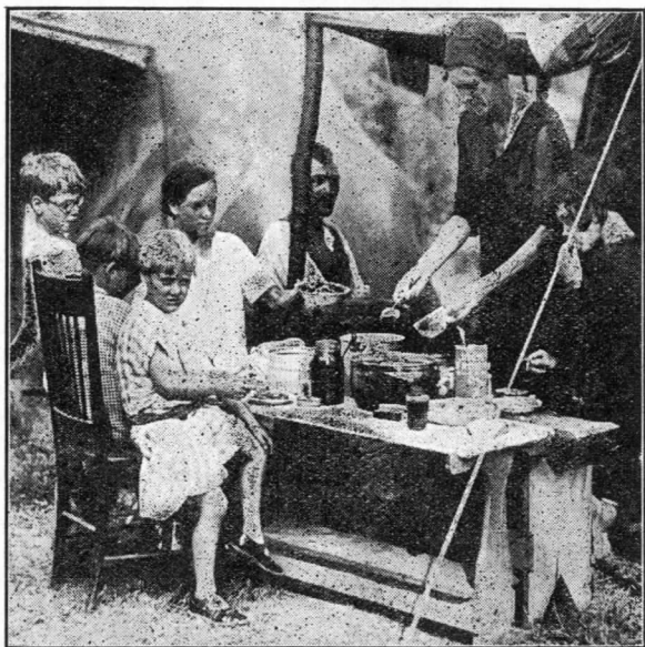
EVICTED FAMILY OF MINERS being housed and fed by the Penn-Ohio Striking Miners' Relief Committee. Help spread this work. Send relief!

The forty thousand miners who are striking against starvation in the mine fields of Pennsylvania, Ohio, West Virginia and Kentucky look to the entire working class to send them relief. Their fight is your fight—a battle against the starvation conditions of the operators and the scab agreements of the United Mine Workers of America. Help crush the labor fakers! Defeat starvation!