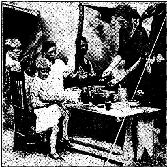
EVICTED FAMILY OF MINERS being housed and fed by the Penn-Ohio Striking Miners' Relief Committee. Help spread this work. Send relief!

The forty thousand miners who are striking against starvation in the mine fields of Pennsylvania, Ohio, West Virginia and Kentucky look to the entire working class to send them relief. Their fight is your fight—a battle against the starvation conditions of the operators and the scab agreements of the United Mine Workers of America. Help crush the labor fakers! Defeat starvation!