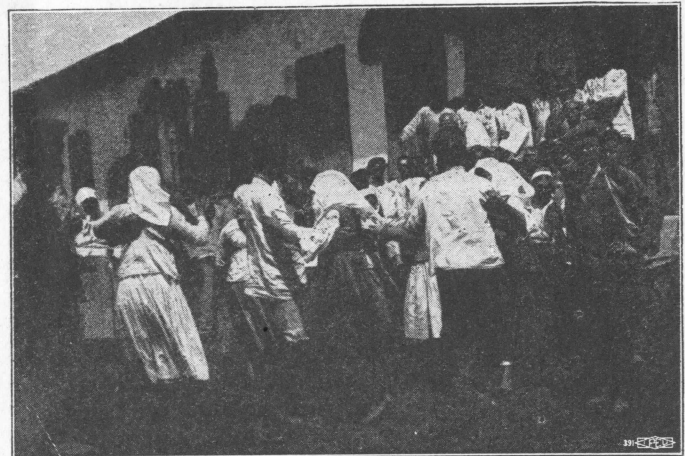
After the political meeting, the Communist workers mingle with the peasants in games and dancing.

The United States, which has played such an important role in the adoption of the Dawes Plan, has maintained a consistent position of uncompromising hostility toward the