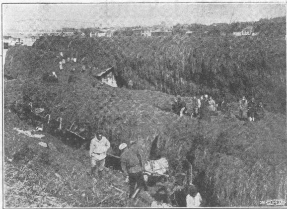
Work in the Fields in Soviet Russia.

The peasants, who have so long been tilling the soil with primitive methods, are now anxious to learn the latest methods and obtain the most improved agricultural machinery.